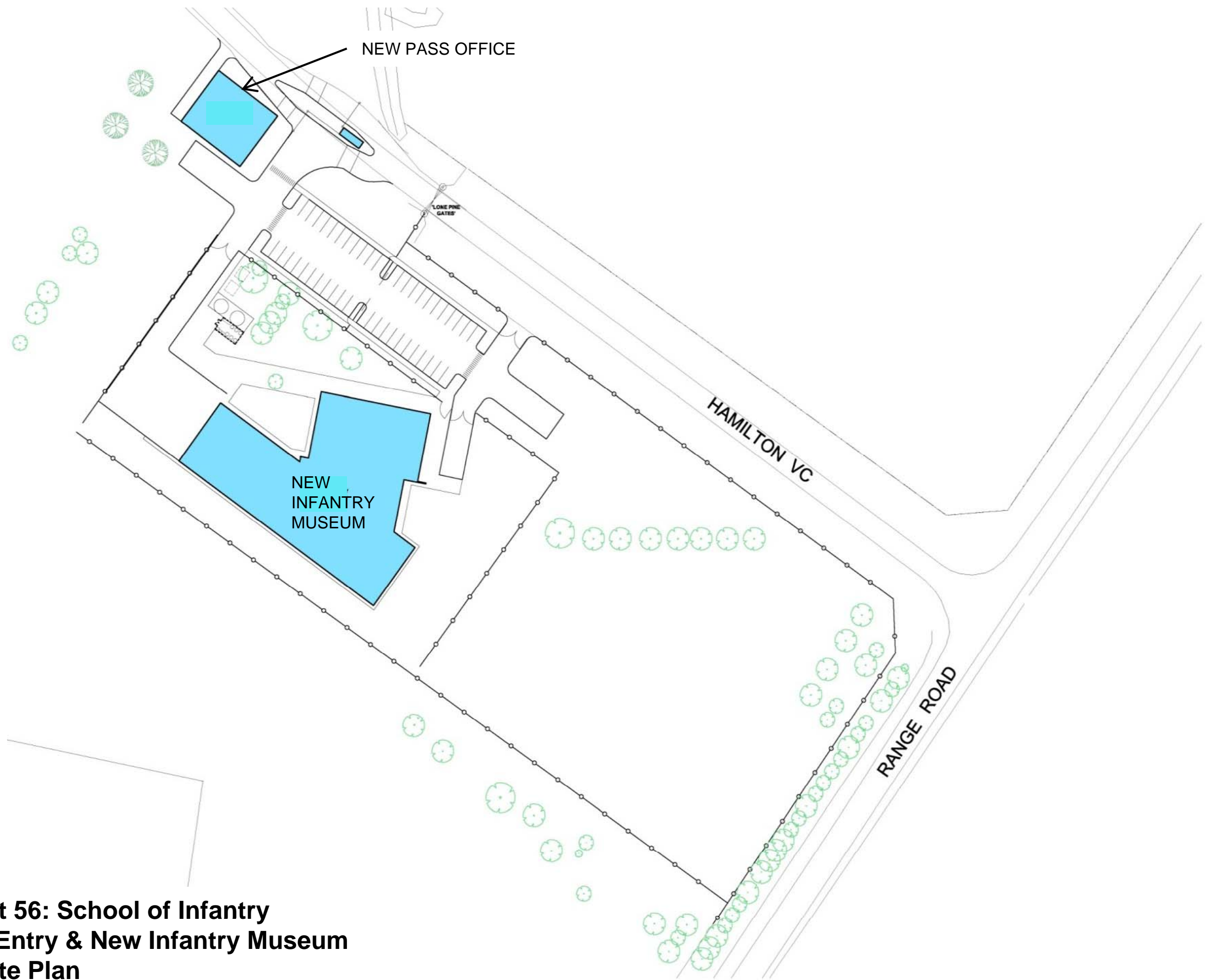
Attachment 56: School of Infantry New Base Entry & New Infantry Museum Precinct Site Plan