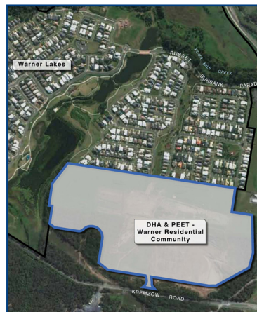
Photograph of the proposed development site.

The primary role of DHA is to support Defence members and their families by providing quality housing.