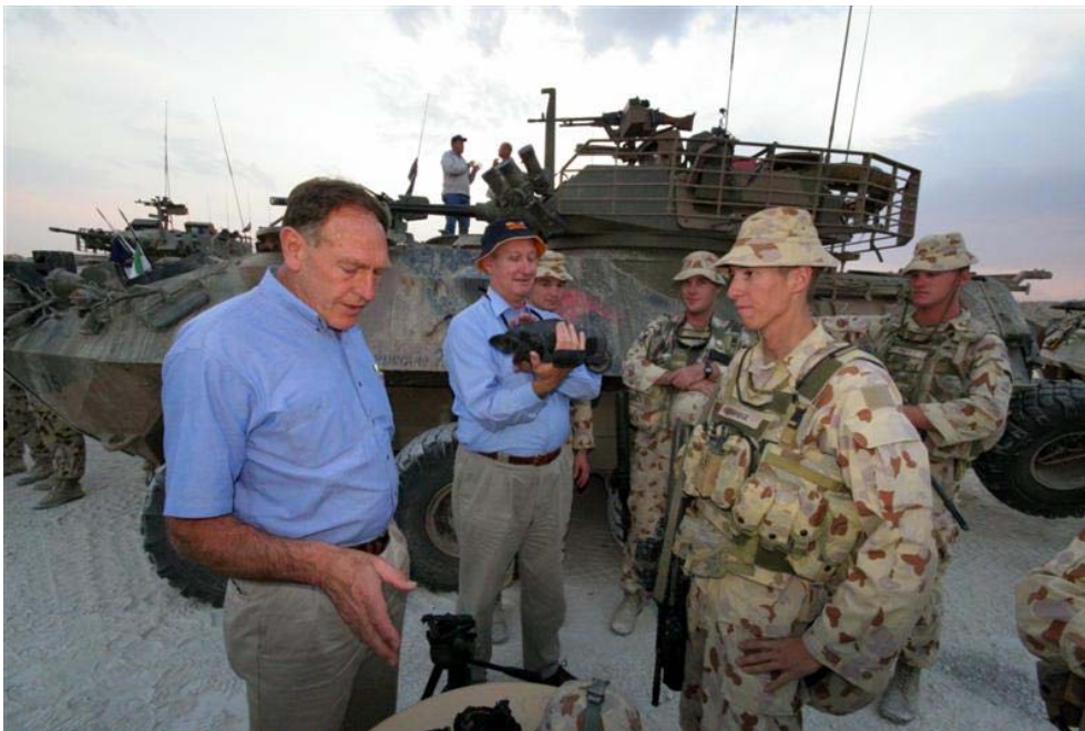
Figure 5.2 Mr Barry Haase MP and the Hon Bruce Scott MP are briefed on the equipment used by the AMTG at Camp Smitty in southern Iraq