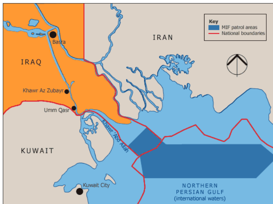
Figure 3.2 The patrol area for HMAS Newcastle in the northern Arabian Gulf