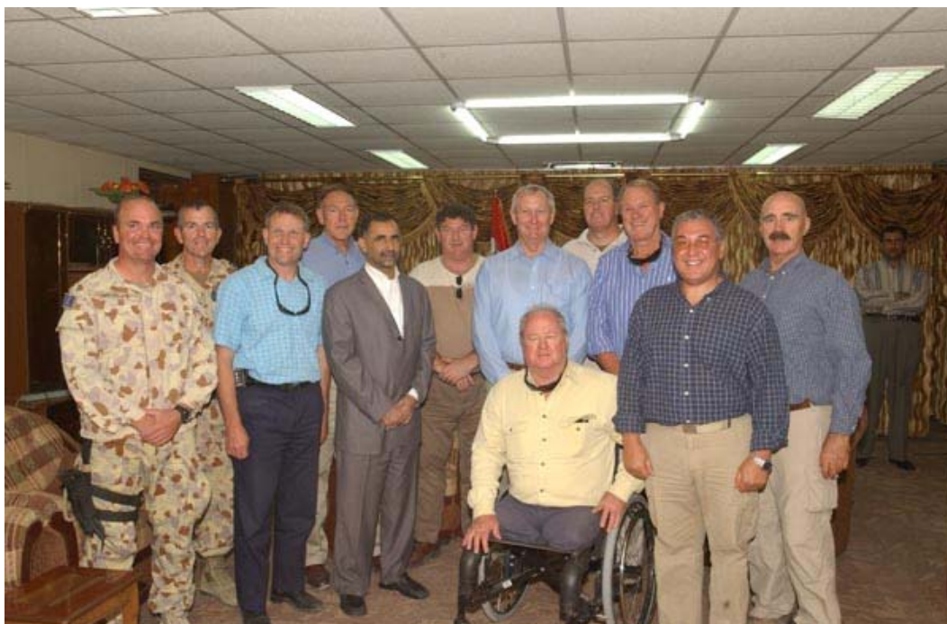
Figure 5.4 The delegation meets with the Governor of Al Muthanna province, Mr Mohammed al Hassani