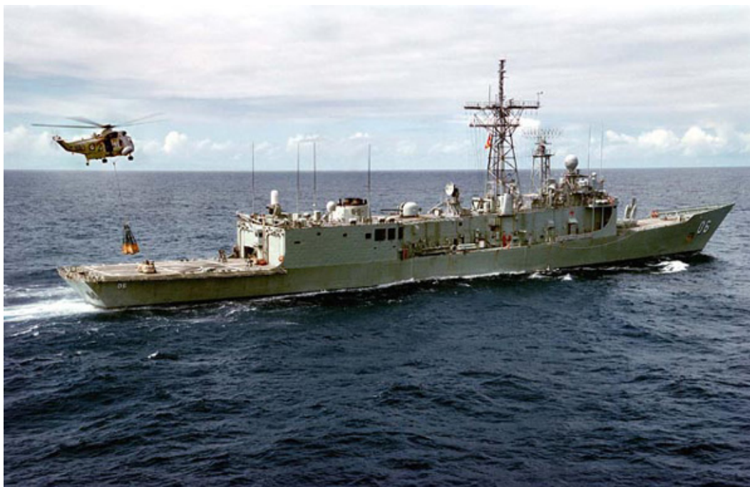
Figure 3.1 HMAS Newcastle conducting replenishment operations