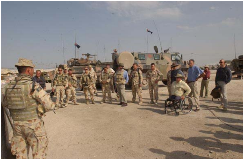
Figure 2.1 The delegation is briefed on the capabilities of the ASLAV and Bushmaster vehicles at Camp Smitty, southern Iraq