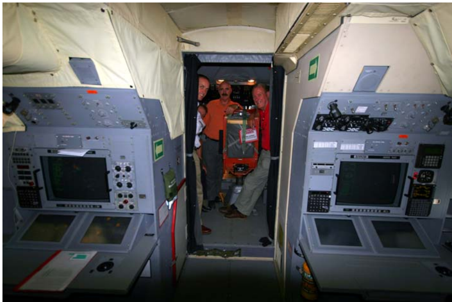
Figure 4.3 The Hon Warren Snowdon MP and the Hon Bruce Baird MP inspect the cockpit of a P3C Orion in the Middle East