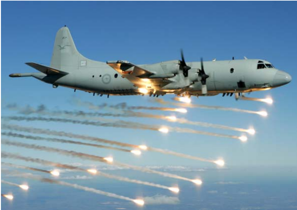
Figure 4.1 A P3C Orion from 92 Wing RAAF, currently deployed to the Middle East, testing its newly fitted Self Protection System