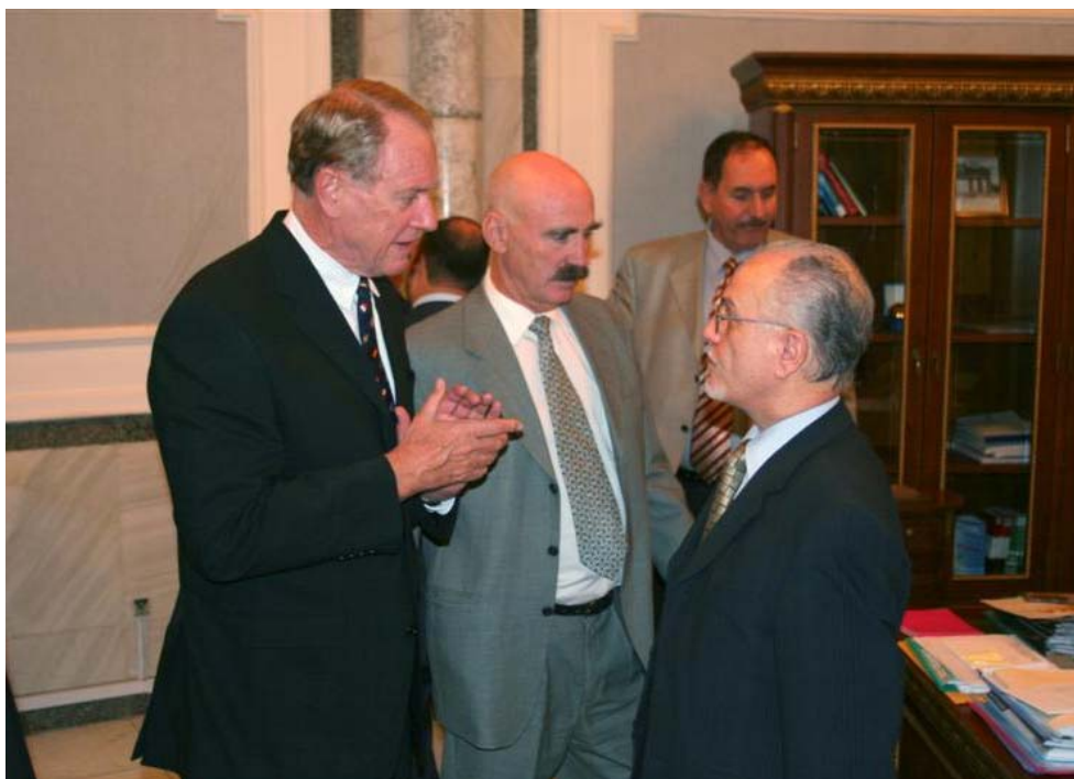
Figure 6.1 The Hon Mr Bruce Baird MP and Hon Warren Snowdon MP meet with members of the Iraqi Interim National Assembly in Baghdad