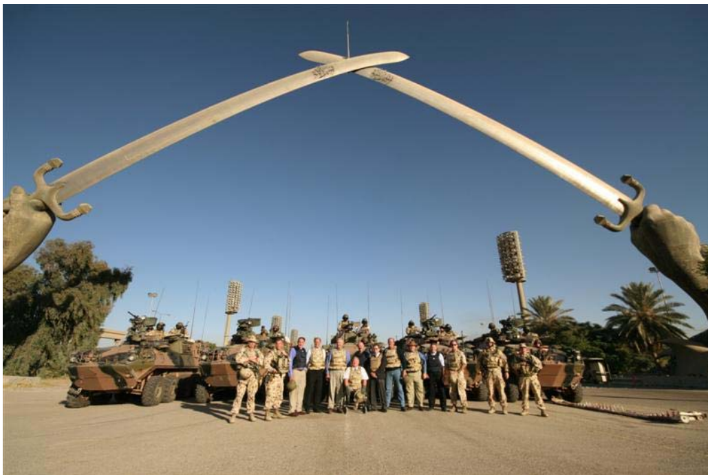
Figure 6.2 Delegates pose with SECDET personnel and ASLAV under the ceremonial arch of the Hussein Regime victory parade in the International Zone, Baghdad

6.16 Australian diplomatic and military staffs in Baghdad are protected by the Baghdad Security Detachment (SECDET). SECDET has distinguished itself in the period since the end of conventional conflict. They have successfully protected the Australian Diplomatic staff from attack while facilitating the conduct of diplomatic operations. They have conducted many hundreds of foot and vehicle patrols through the city, earning the trust of the locals amongst whom they have lived.