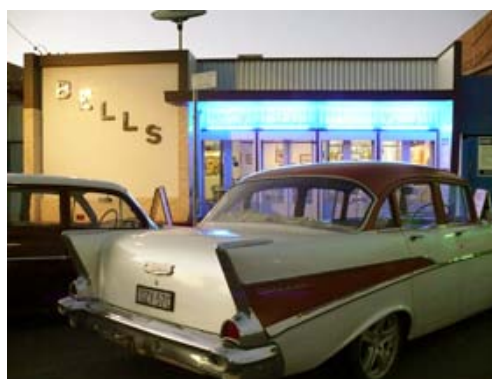
Bells Milk Bar & Museum (est 1892 as a confectioner and cordial maker)

I have been involved in this capacity for over seven years. During this time I have also been actively involved in the local Broken Hill community including as a member of the local council Tourism and Film advisory groups, and as chairman of the Red Desert Live music and arts festival. As of November 2010, I volunteer as the founding chairman of Patton Village Community & Business Association, which was established to help develop a sustainable future for South Broken Hill and communities, which consists of lower socio-economic demographics. (I am writing this submission as a community member and business owner). Over the last seven years I have noticed some positive changes to our precinct, which with the right support will lead to sustainable community wellbeing for our precinct.