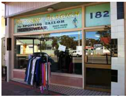
Trading over 50 yrs