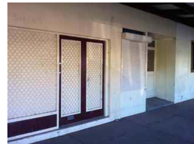
Vacant, For Rent, or For Sale