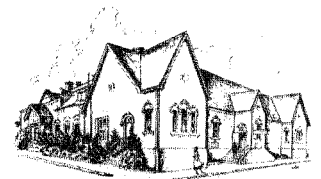
Tenterfield School of Arts