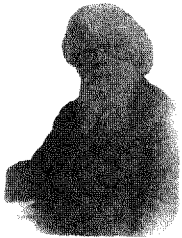
Sir Henry Parkes

Secretary Standing Committee on Agriculture, Fisheries and Forestry Parliament House CANBERRA ACT 2600