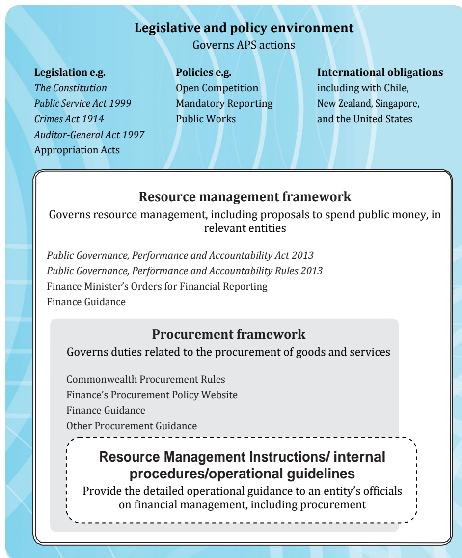
Figure 3: Legislation and policy governing Commonwealth Procurement.

2.10 Relevant entities and officials operate in an environment of legislation and Commonwealth policy. Within that broad context, the resource management framework consists of the legislation and policy governing the management of the Commonwealth's resources. Figure 3 sets out the main elements of this environment related to procurement .