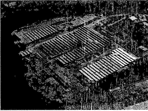
Rheem Rydalmere NSW Gas, Electric and Solar Water Heater Manufacture

Rheem has three large manufacturing sites throughout the country: