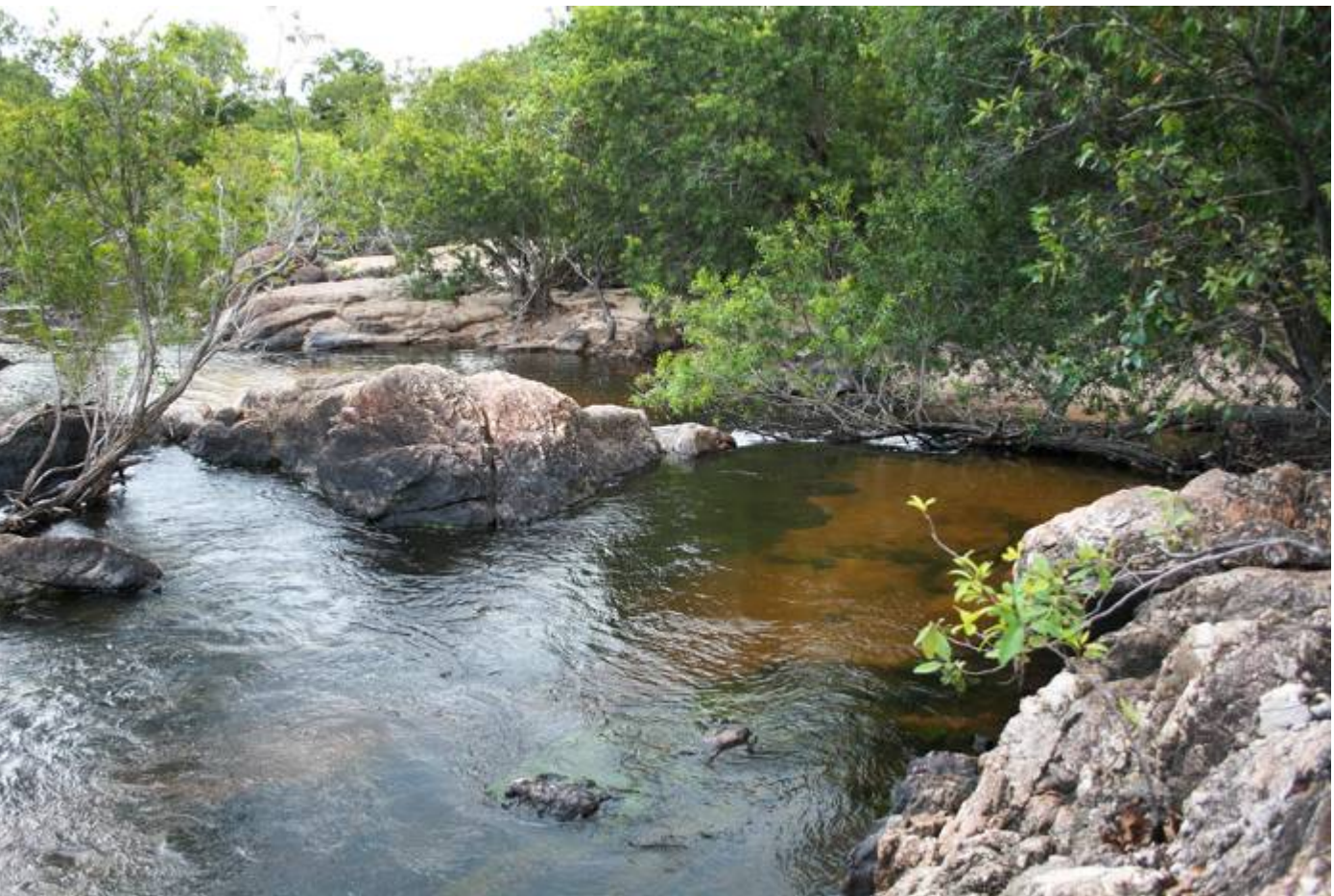
Upper Wenlock River near Chuulangun

The Wenlock Basin Wild River Area took effect on 4 June 2010 and the Pascoe River has been targeted for nomination under the Queensland Wild Rivers Act. In May 2009 the Chuulangun Aboriginal Corporation presented a submission to the Queensland government supporting the Wenlock Basin declaration and we will also support a wild river declaration for the Pascoe Basin. As outlined in our submission to the Queensland government, and our submission to last year's Senate Inquiry into the Wild Rivers (Environmental Management) Bill, wild river areas on our homelands are consistent with our economic development, homelands development and land management aspirations. The Wild Rivers Act in no way diminishes our right or ability to live and work on, undertake sustainable economic development, and control the management of our traditional lands and waters.