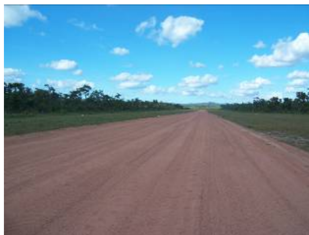
Chuulangun airstrip

A community approach needs to be taken into consideration with government policies and programs through a better coordinated whole of government approach. There should be less separation of Indigenous from mainstream programs. For example, Wild River Rangers should be open to both Indigenous and non-Indigenous people and organisations.