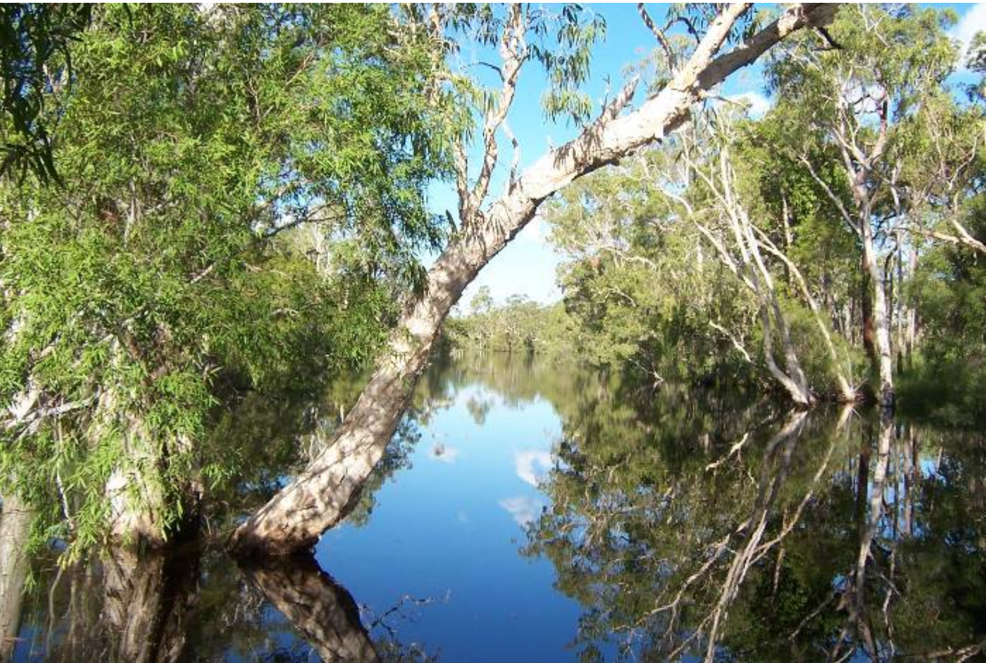
Mountain spring-fed lagoon, upper Wenlock River

Other relevant acts that need reform are mining acts and special agreements acts. In regard to the Wenlock Basin Wild River Area, special water allocation rights have been given to mining companies, namely Rio Tinto Alcan at Weipa on the west coast of Cape York Peninsula. Such Special Agreement Acts are inconsistent with the wild river declarations, and should be rescinded. There is a need to reform the Minerals Act to recognise Traditional Custodians rights to and management of country. Ideally, the recognition of Indigenous rights and interests in land, water and resources should be incorporated into all Acts of government. Hopefully, the decision of the Gillard government to work towards the formal recognition of Indigenous people in the Constitution will be the first step towards ensuring this happens.