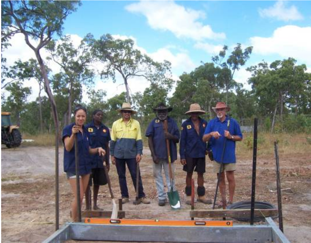
Chuulangun Rangers, Green Army participants and ICV volunteer undertaking a training module at Chuulangun

It is our aim, with the support of the various government programs and local Indigenous people and organisations, to help train and capacity-build people to take up permanent full-time positions in the environmental services industry. Importantly, land management and conservation is increasingly being seen as a viable and sustainable industry in Australia's remote regions, with support from such programs as Working on Country and Indigenous Protected Areas under the Commonwealth government, and Wild Rivers under the Queensland government.