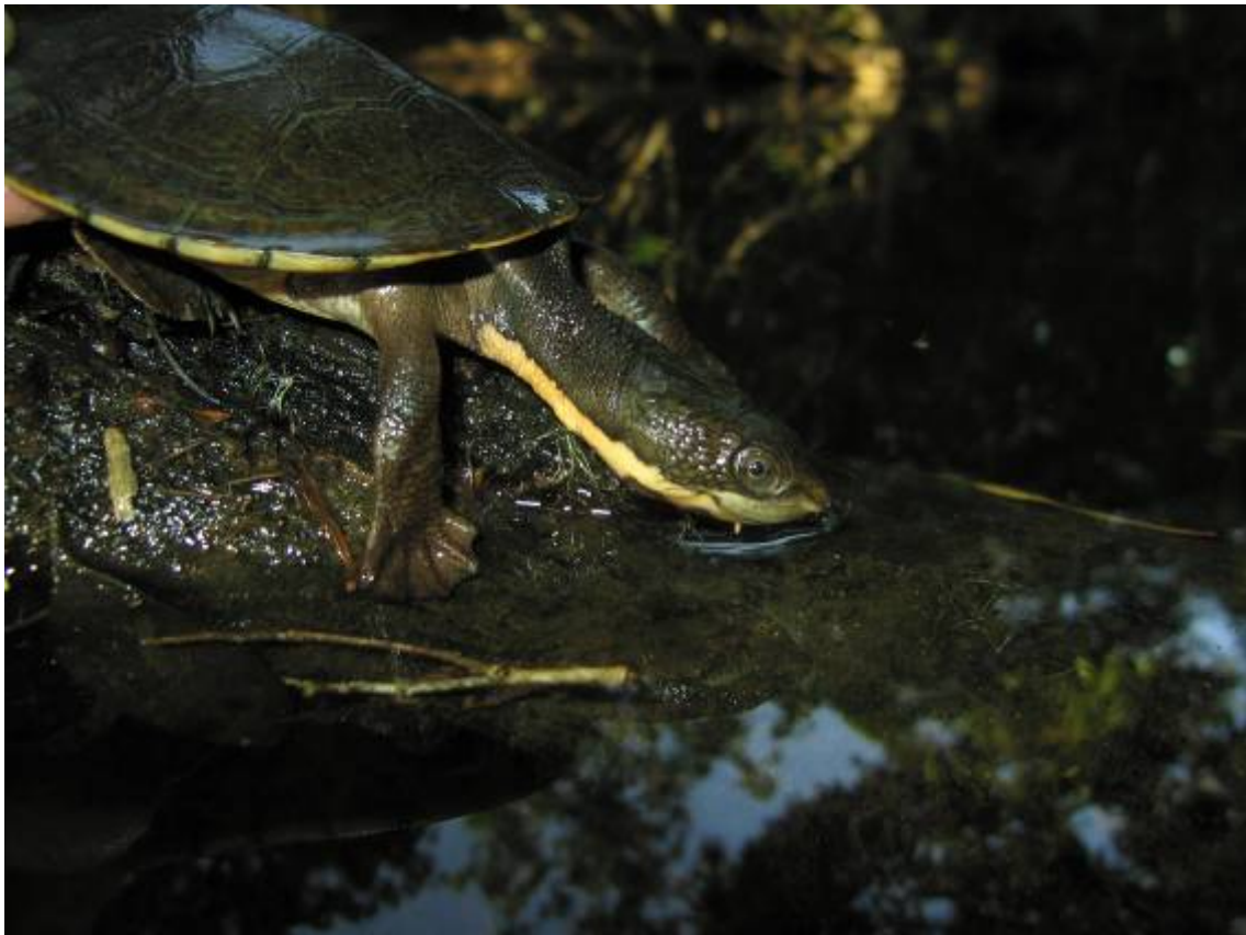
Freshwater turtle, Elseyia latisternum