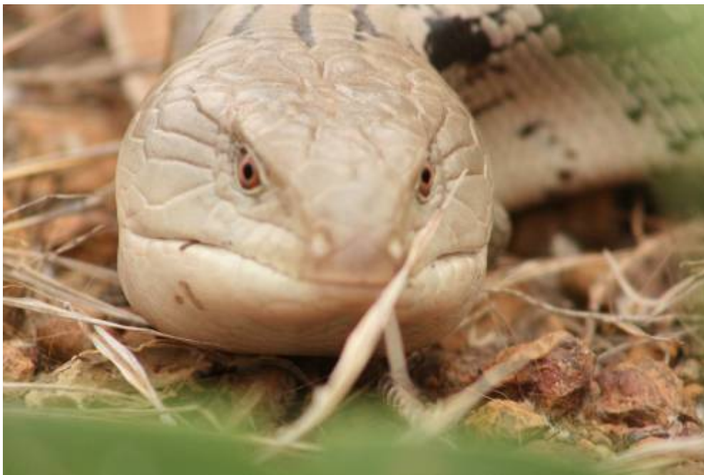
Blue tongue lizard, Chuulangun