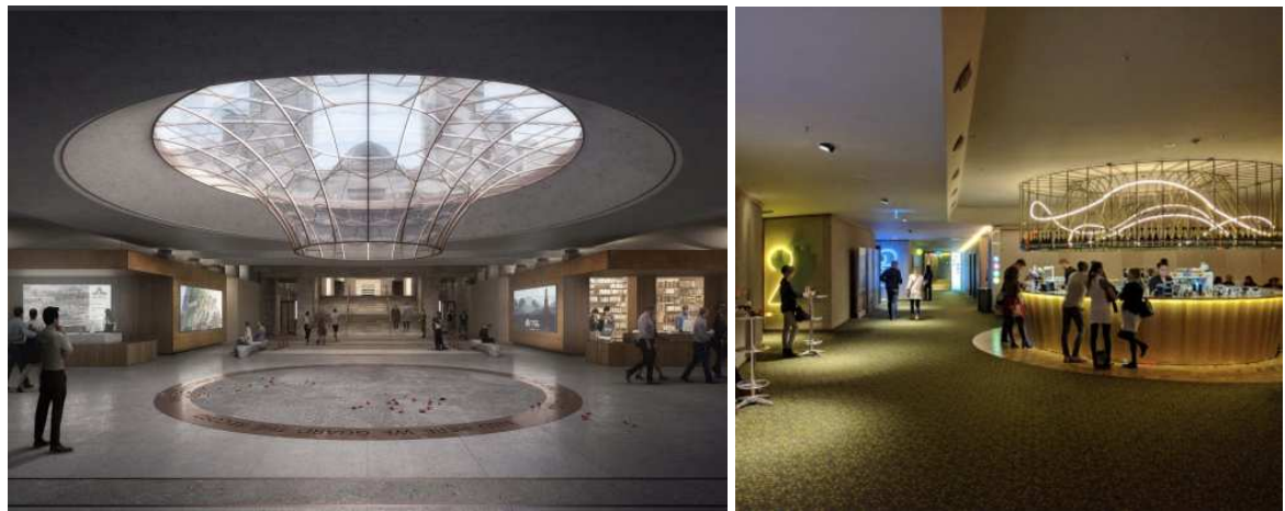
Proposed new War Memorial entry

There is no public value to be gained by destroying the existing character of serenity and contemplation and making the memorial look like a shopping mall. For example, the precinct's proposed new entry foyer looks more like the Palace cinema Prosecco bar than a dignified memorial entrance.