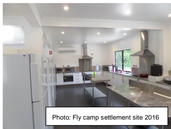
Photo: Fly camp settlement site 2016