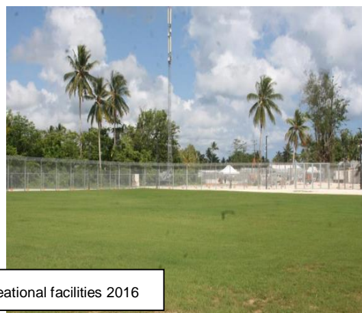
Photo: Manus RPC recreational facilities 2016