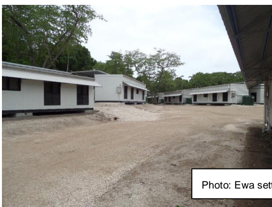
Photo: Ewa settlement site 2016