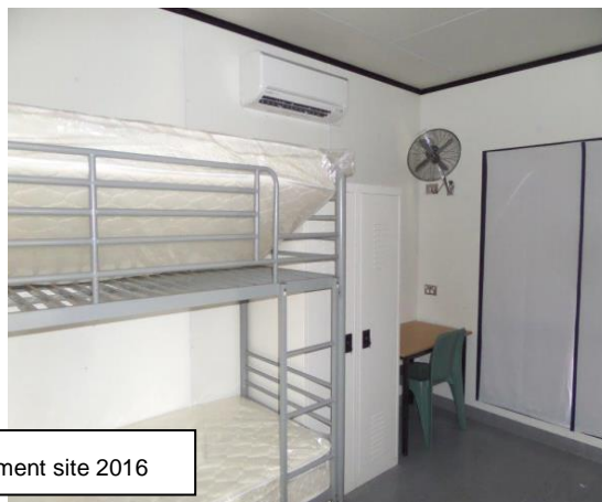
Photo: Anuijo settlement site 2016