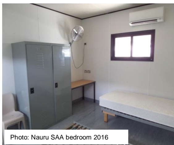
Photo: Nauru SAA bedroom 2016

RPCs in Nauru and Manus include specialist managed accommodation areas (MAA) where vulnerable transferees who present an immediate threat to others or themselves, or pose a risk to the security of the centre can be temporarily placed. The MAA is designed and managed to mitigate self-harm attempts or attempts to harm others through constant monitoring in a controlled environment, away from other transferees and staff. Situations in which a transferee would be placed in the MAA may include assaults on others, threatening others with violence, and actual self-harm requiring restraint to prevent injury.