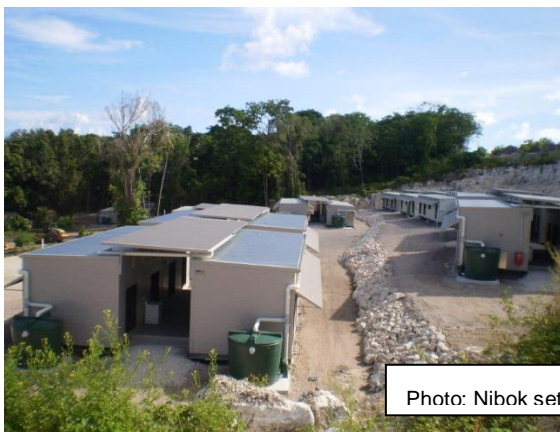
Photo: Nibok settlement site 2016

The Department has facilitated a range of accommodation options for refugees in Nauru, including privately leased houses, renovated and purpose built accommodation complexes. Accommodation is generally self-contained, with shared or stand-alone kitchen and laundry facilities and communal areas. Where appropriate, air-conditioning will be retro-fitted to accommodation during 2016.