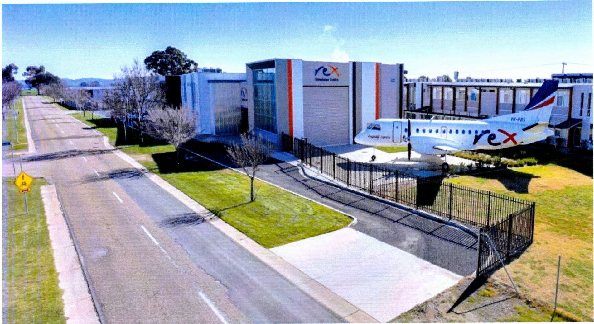
Australian Airline Pilot Academy (AAPA) – Wagga Wagga NSW