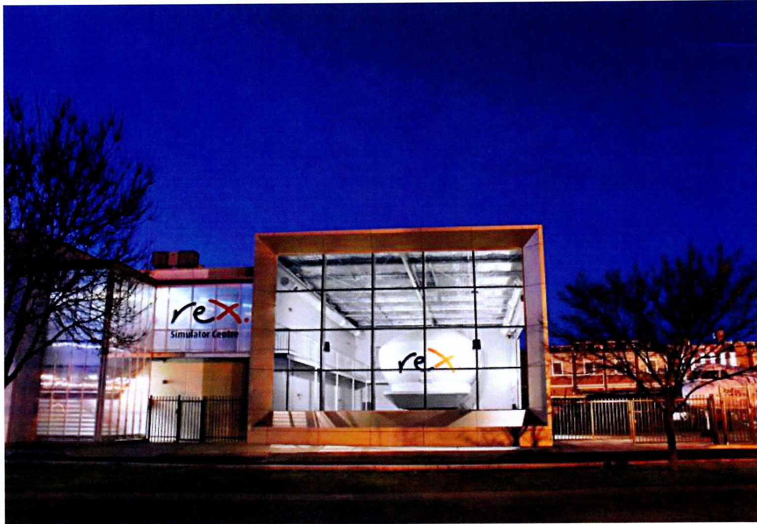
Saab 340 Flight Simulator – Wagga Wagga NSW