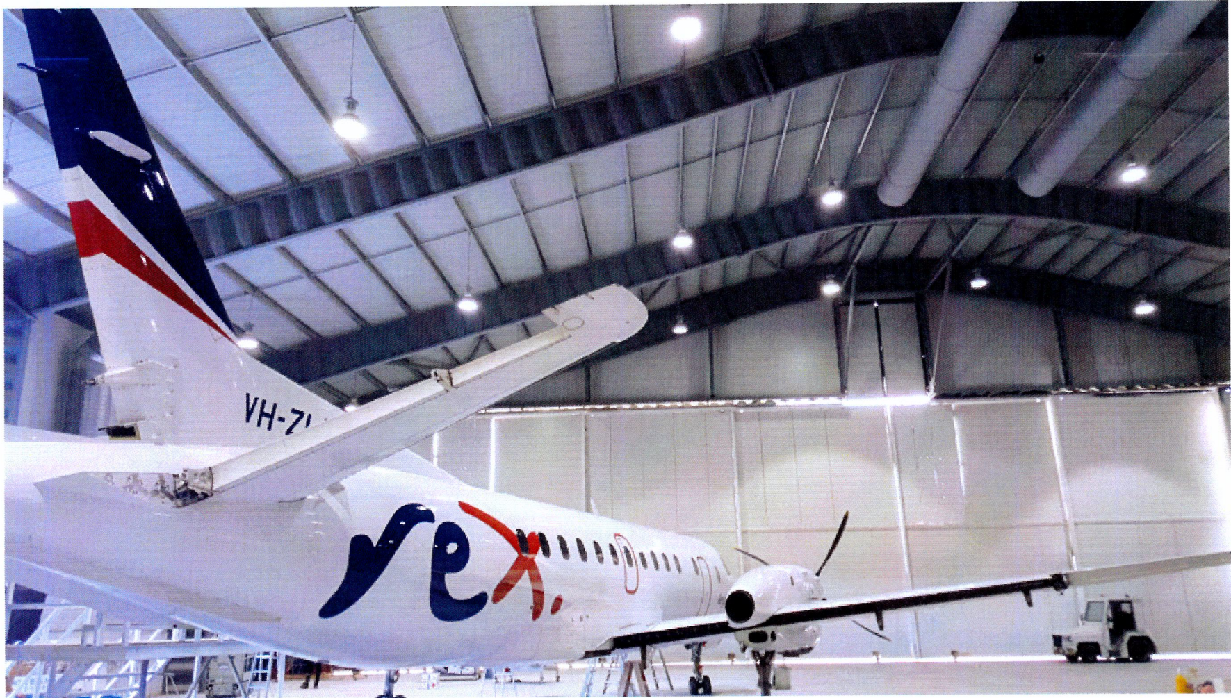
Aircraft Painting Facility – Wagga Wagga NSW