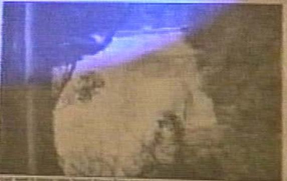
Wind monitoring towers in the Corner Inlet area of South Gippsland Shire Council.

South Gippsland Shire Council has refused two applications for wind monitoring towers in the Corner Inlet area. The council's decision was based on concerns over the impact of wind farms on the local environment and community. The council stated that the proposed towers would be a major step towards the wind farm industry, and it was not happy to see that. The council has concluded by voting to reject the proposed towers that it is not going to have a wind farm in our area.