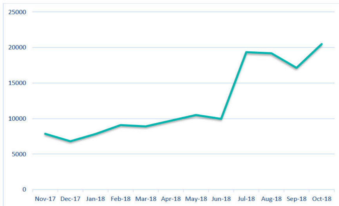
Figure 3: Monthly pageviews, last 12 months