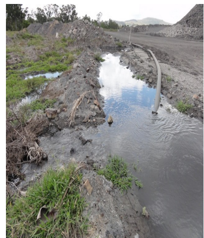
Leighton's pump crew had decided to use this channel to carry water pumped from the pit because the 2 highwall pumps usually used to take this water to the south of the pit were broken down. Sonoma Mine Management was not aware that this was occurring.