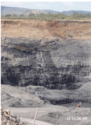
Sonoma Coal Mine pit (Strip 8/9, Block 10) 12.9.10 11.26am. Dewatering Pump running at approx. 50 litres/sec

In 2005 at public information sessions held by Qcoal & ELP for the proposed Sonoma Coal Project explicit promises were made to mine no closer than 100 meter from Coral Creek. We discover that the buffer for the pit was reduced to 30 meters only after getting photographic evidence. We also learn that associated mine works like roads, levees, bunds etc. can come even closer than 30 meters as can be seen here.