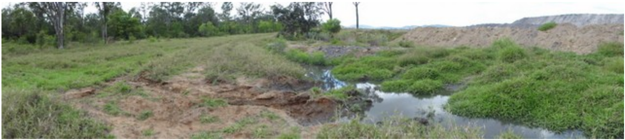
Coral Creek Sonoma 12.9.10 – 11am . Signs of levee bank channel overflow.

In 2005 at public information sessions held by Qcoal & ELP for the proposed Sonoma Coal Project explicit promises were made to mine no closer than 100 meter from Coral Creek. We discover that the buffer for the pit was reduced to 30 meters only after getting photographic evidence. We also learn that associated mine works like roads, levees, bunds etc. can come even closer than 30 meters as can be seen here.