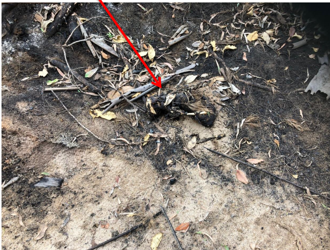
Image J - Scorched Koala