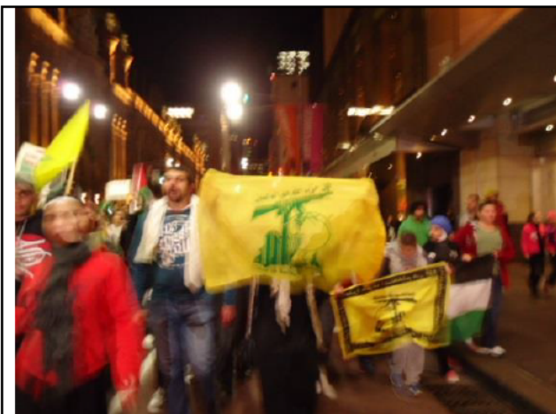
Nakba Day protest, Sydney CBD, 15 May 2013

Since at least 2008 Hizballah flags have been displayed almost every year at various street protests in Sydney and Melbourne. The flag includes an image of a fist grasping an assault rifle. The routine display of the Hizballah flag with complete impunity is a potential rallying point for extremist groups and individuals to come together at these protests and further develop their networks. This risks creating a pool of people who are emotionally and mentally susceptible to extremist ideologies and from among whom Hizballah and other terrorist organisations can recruit operatives. At one rally in 2012, a known prominent figure among Australia's neo-Nazis, Ross 'The Skull' May, was observed marching with a group displaying the Hizballah flag, suggesting a degree of ideological affinity and the potential for collaboration between Islamists and neo-Nazis.