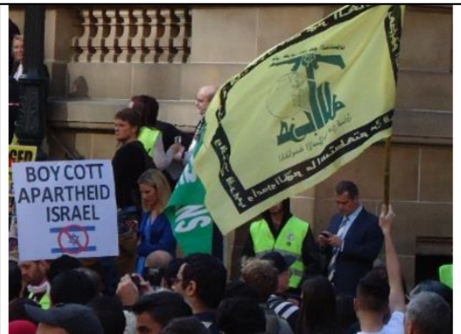
Anti-Israel protest, Sydney Town Hall, 27 July 2014