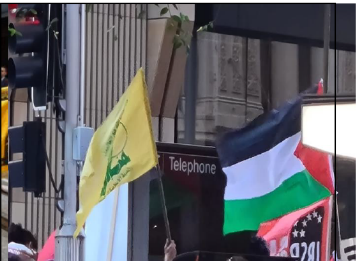
Nakba Day protest, Sydney CBD, 15 May 2021