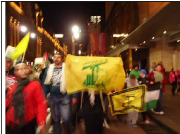
Nakba Day protest, Sydney CBD, 15 May 2013

Since at least 2008 Hizballah flags have been displayed almost every year at various street protests in Sydney and Melbourne. The flag includes an image of a fist grasping an assault rifle. The routine display of the Hizballah flag with complete impunity is a potential rallying point for extremist groups and individuals to come together at these protests and further develop their networks. This risks creating a pool of people who are emotionally and mentally susceptible to extremist ideologies and from among whom Hizballah and other terrorist organisations can recruit operatives. At one rally in 2012, a known prominent figure among Australia's neo-Nazis, Ross 'The Skull' May, was observed marching with a group displaying the Hizballah flag, suggesting a degree of ideological affinity and the potential for collaboration between Islamists and neo-Nazis.