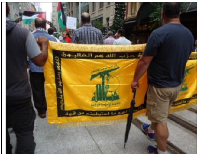
Anti-Israel protest, Sydney CBD, 17 Dec. 2017