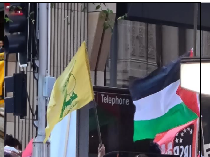
Nakba Day protest, Sydney CBD, 15 May 2021