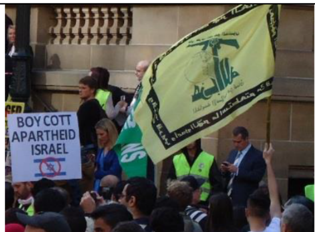
Anti-Israel protest, Sydney Town Hall, 27 July 2014