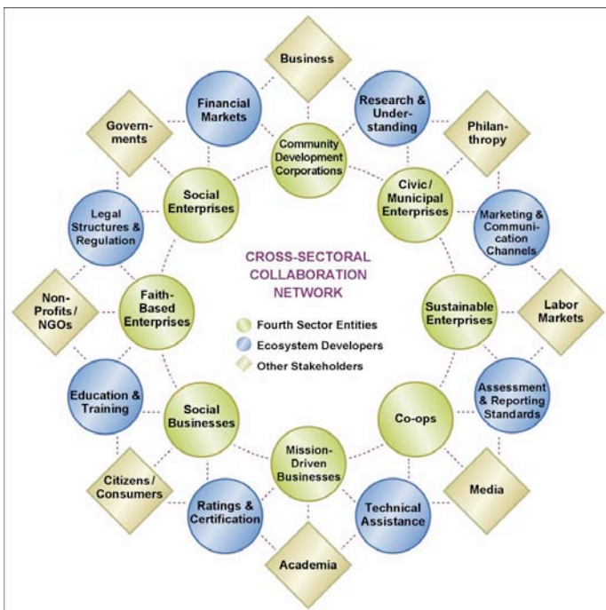
Figure 4. Cross-Sectoral Networks for Collaboration to Accelerate Ecosystem Development

The emerging Fourth Sector is a beacon of possibility in a world in need of hope. It has the potential to address many of the critical systemic challenges we are facing today. There is currently a tension between the will toward emergence and the constraining status quo. By stepping forward individually and collectively, we can take responsibility for our common future and tip the balance in favor of truly transformative and lasting change.