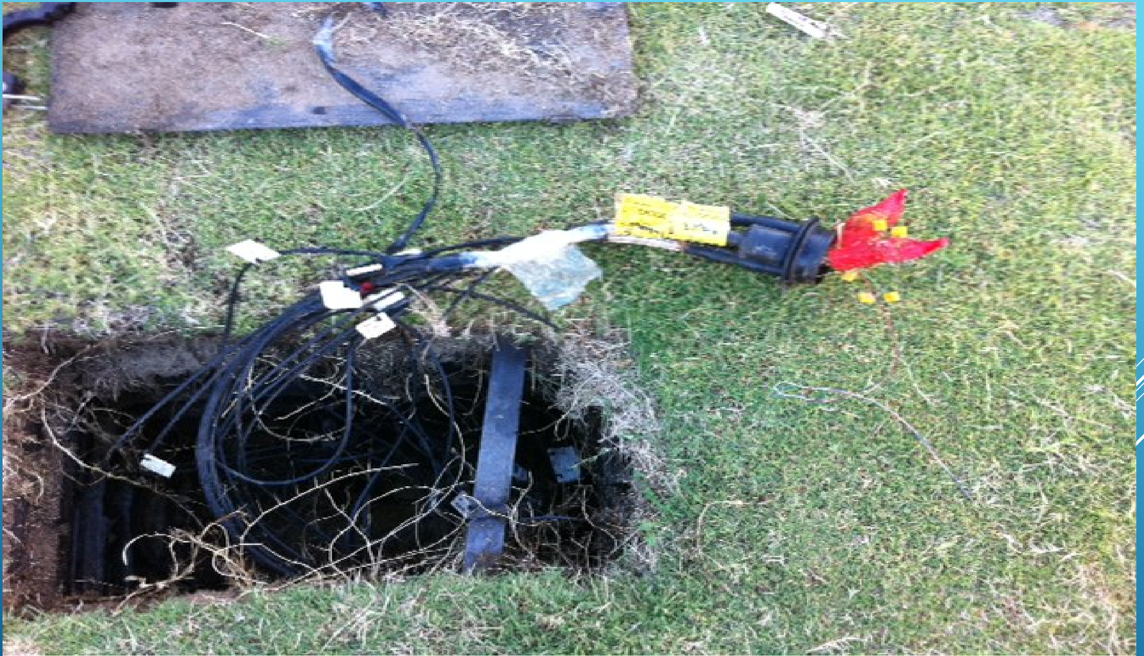
Photo: Energy in the network Project: Powerline GPS: 52.020000, 10.000000 Date: 2023-01-10 10:00:00