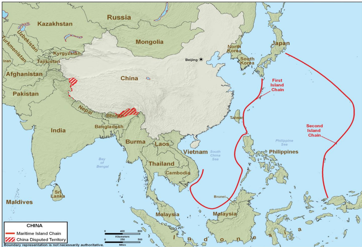
Figure 3. The First and Second Island Chains. PRC military theorists conceive of two island “chains” as forming a geographic basis for China’s maritime defensive perimeter.

China is also demonstrating a growing interest and capability in undertaking long-range submarine operations through the South China Sea and into the Indian Ocean with several deployments of PLAN submarines to Pakistan & Sri Lanka from 2014 onwards. 14 Indian defence analyst P.K.Ghosh states of Chinese submarine operations in the Indian Ocean that: