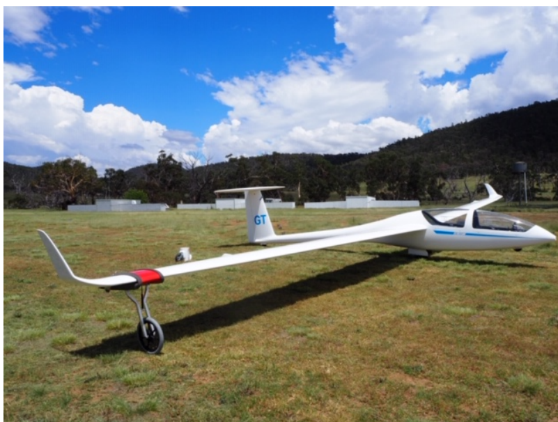
High-performance DG1000S Twin-Seater Sailplane