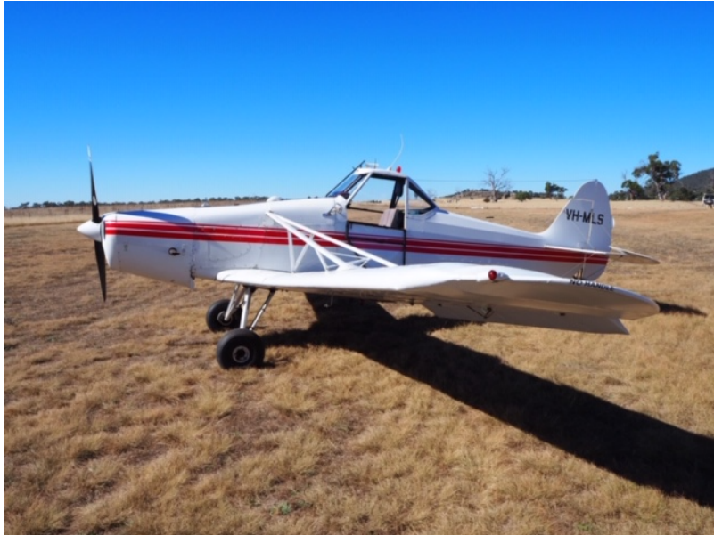
Pawnee PA-25 235HP Glider Towplane