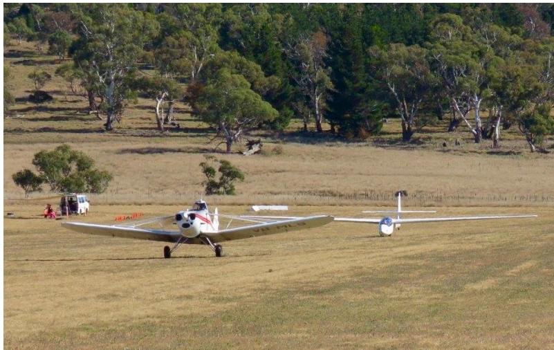
Aerotow Launch – Pawnee PA-25 Towing a Puchacz Twin-Seater Glider on Take-off