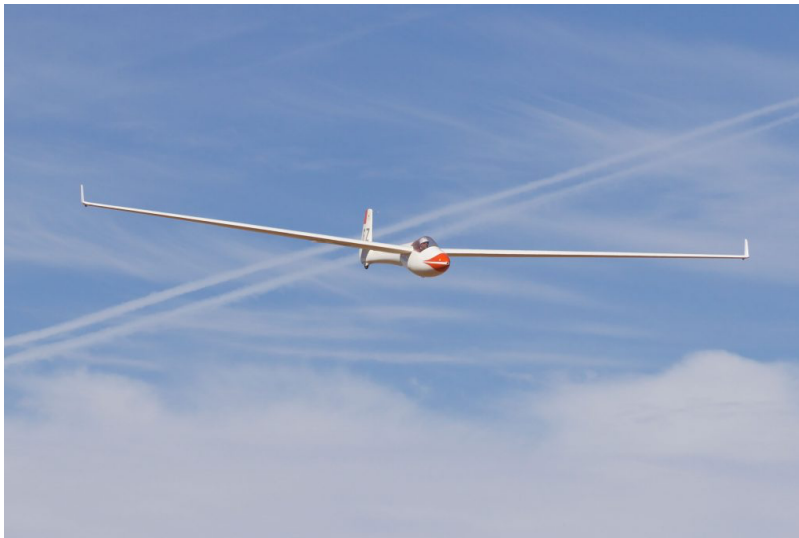
F1 GP Competition Finish, Leeton NSW