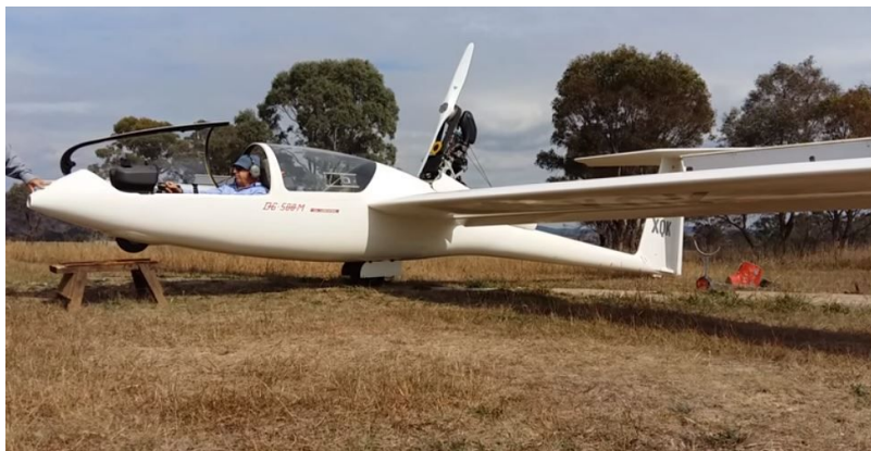
DG500M Self-Launching Glider - Powered Sailplane with Retracting Propeller