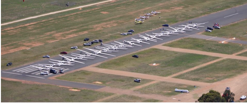
Starting Grid for Gliding Competition, Temora NSW