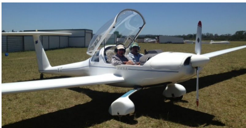
Dimona Touring Motor-Glider – Non-Retracting Propeller