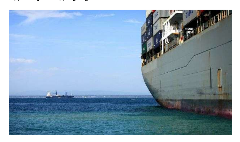
Opponents to the shipping industry changes say they will cost jobs.

Less than 100 seafarers would remain in employment out of a current workforce of 1177, according to a report written by the Australia Institute, based on government documents supporting its Shipping Legislation Amendment Bill.