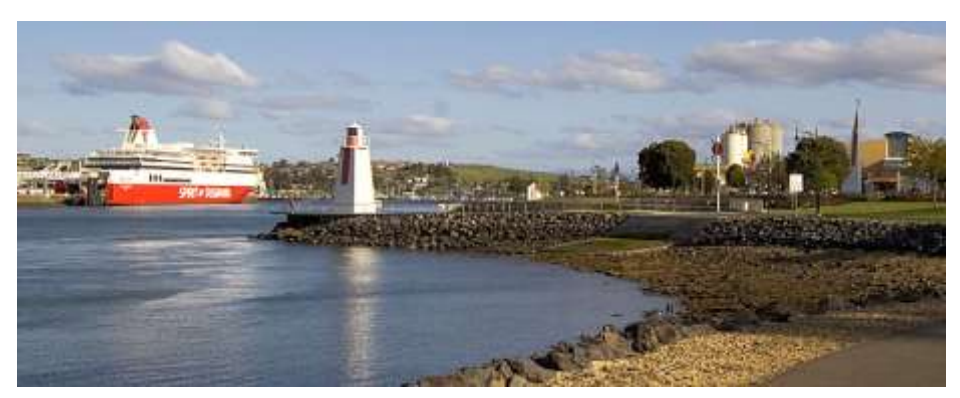
Devonport Port Tasmania

What will the impact be if local shippers remove themselves from the market – ie: employment, impacts on communities and coastal port towns?