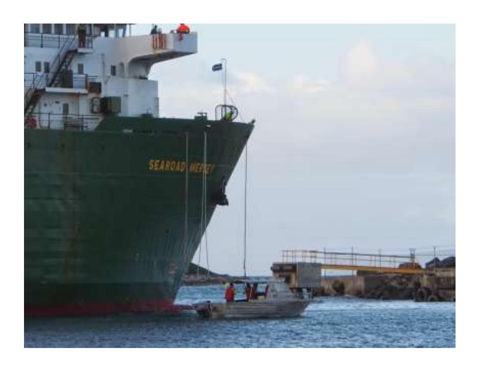
King Island Port - Tasmania

In times where one shipper is forced from service (in the case of Spirit of Tasmania suffering damage in a freak wind event in port in Melbourne in 2016), can the current shippers collaborate and maintain the freight service requirement — can foreign vessels provide an alternate option?