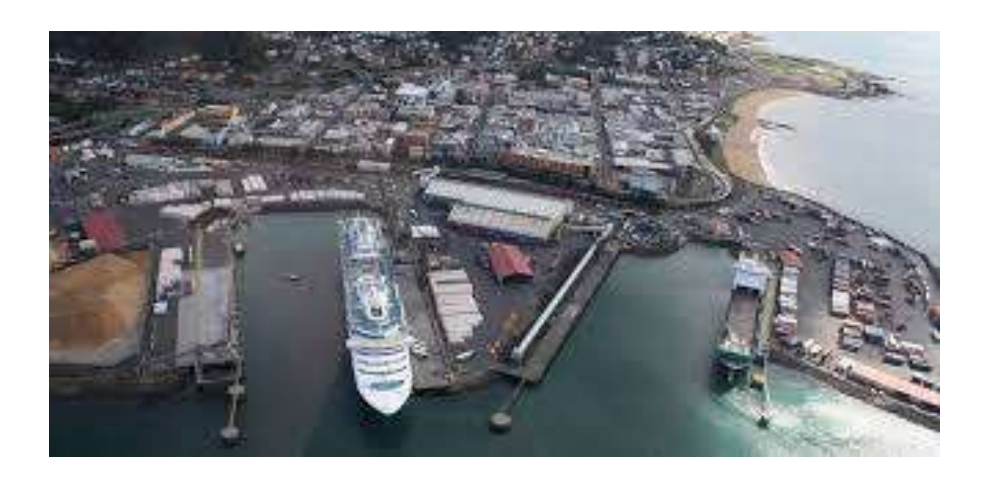
Hobart Port - Tasmania

Additionally, the lack of relief for bulk commodity shipments could potentially threaten the ongoing long term viability of Tasmanian based industry where no low cost alternate shipping options can be sourced.