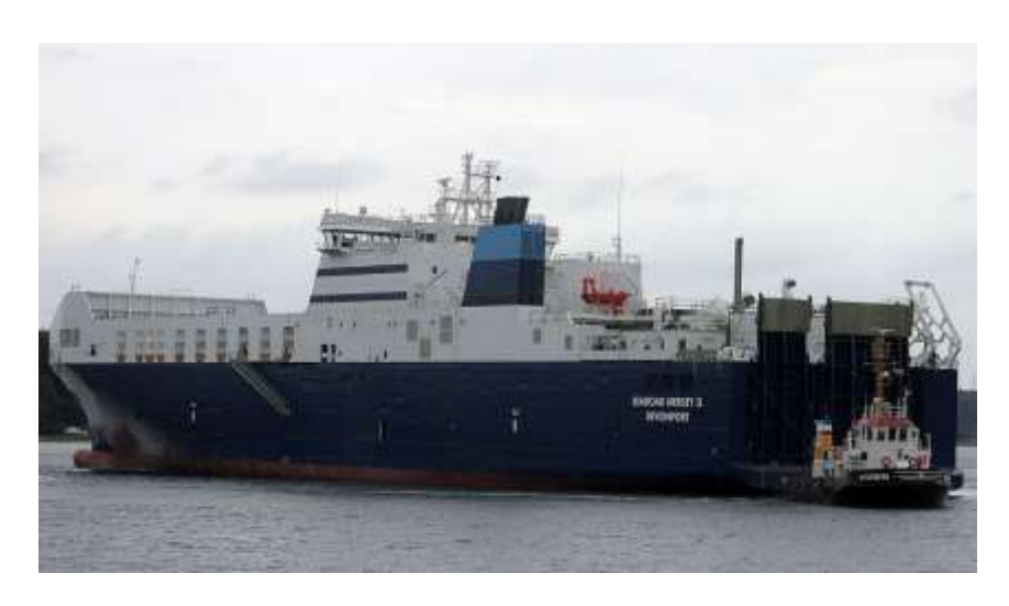
SeaRoad Mersey 2

A well publicised campaign against these changes has been orchestrated to provide the public with an understanding as to why the Act needs to remain for Australia. Specifically, the need to protect jobs and to maintain the security and integrity of Australia's maritime shipping industry.