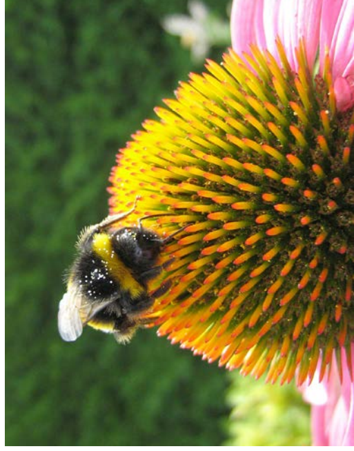
Bumblebees have been viewed as an invasive species wherever they have been introduced.