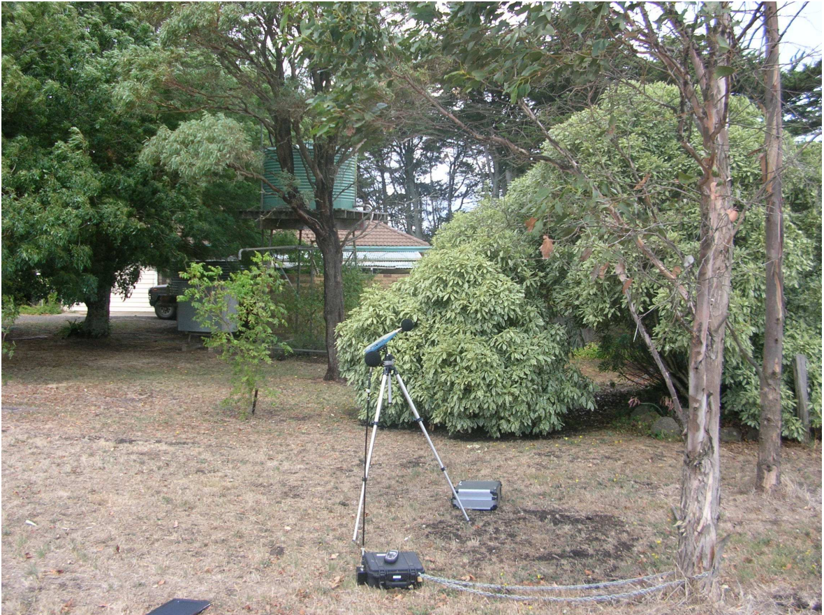
A photo taken by Marshall Day Acoustics of their sound logger. This was placed at the rear of our house - the north side of the house away from the turbines to the south and south east. The noise reader was always chained to a tree approximately 4-5 metres further to the west of this photographed location.