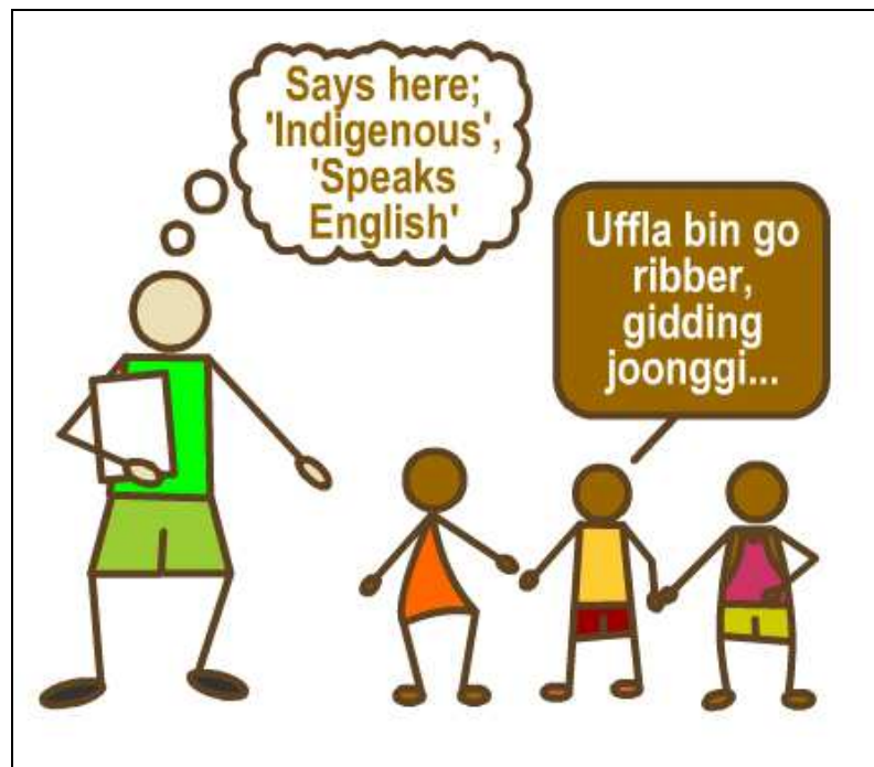
Figure 2: Much data about Indigenous students' language backgrounds is highly inaccurate. The language variety spoken by the children above is 'Yarrie Lingo', a creole spoken by most members of the Yarrabah community in far north Queensland. A very high percentage of Yarrabah students are, therefore, ESL learners.