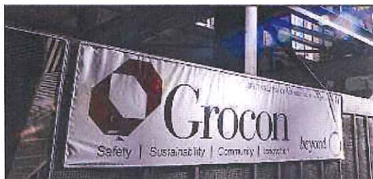
Grocon: Absorbing substantial economic damage