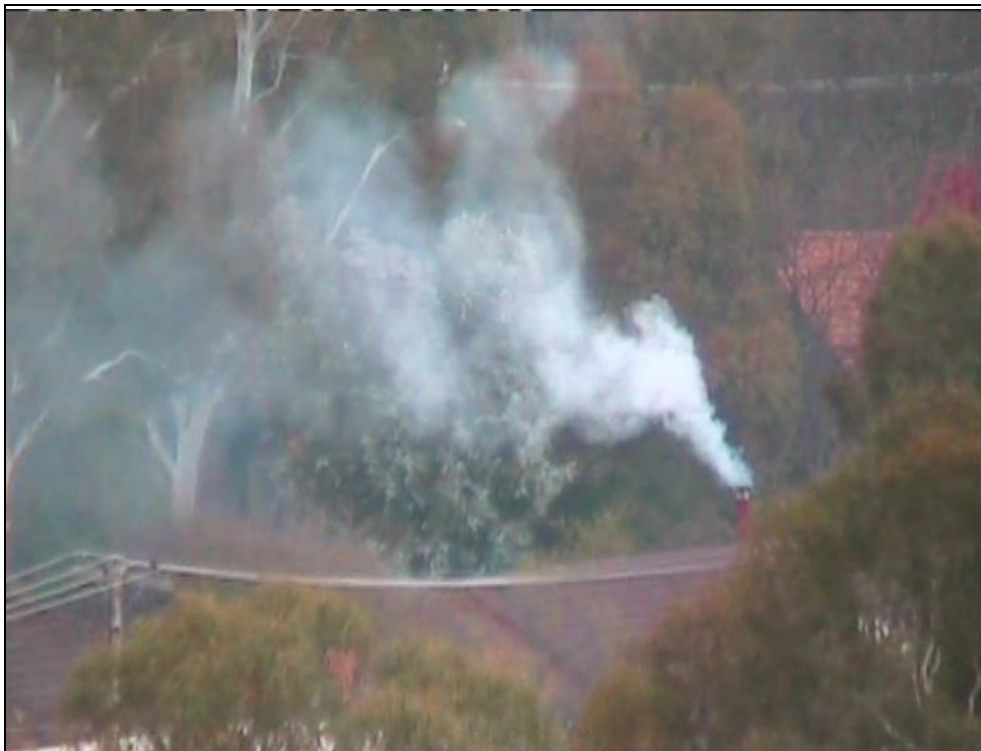
A wood heater in operation in Tuggeranong ACT