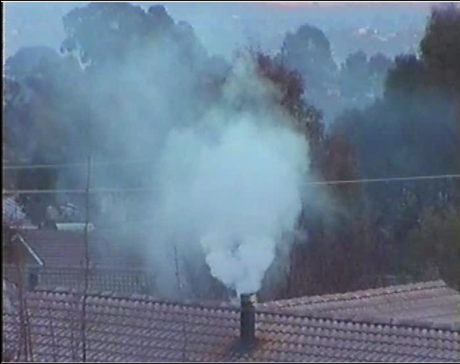
A wood heater in operation in Tuggeranong ACT