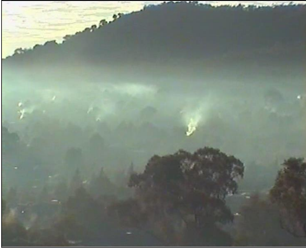
Wood smoke in the Tuggeranong Valley ACT