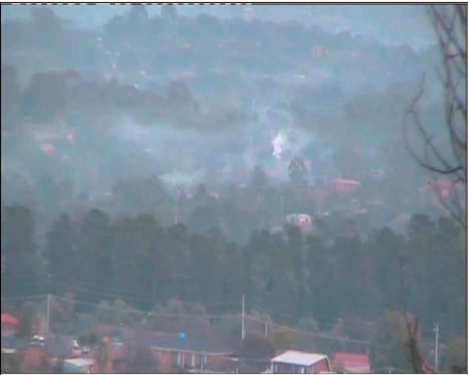
A typical winter's day in Tuggeranong ACT