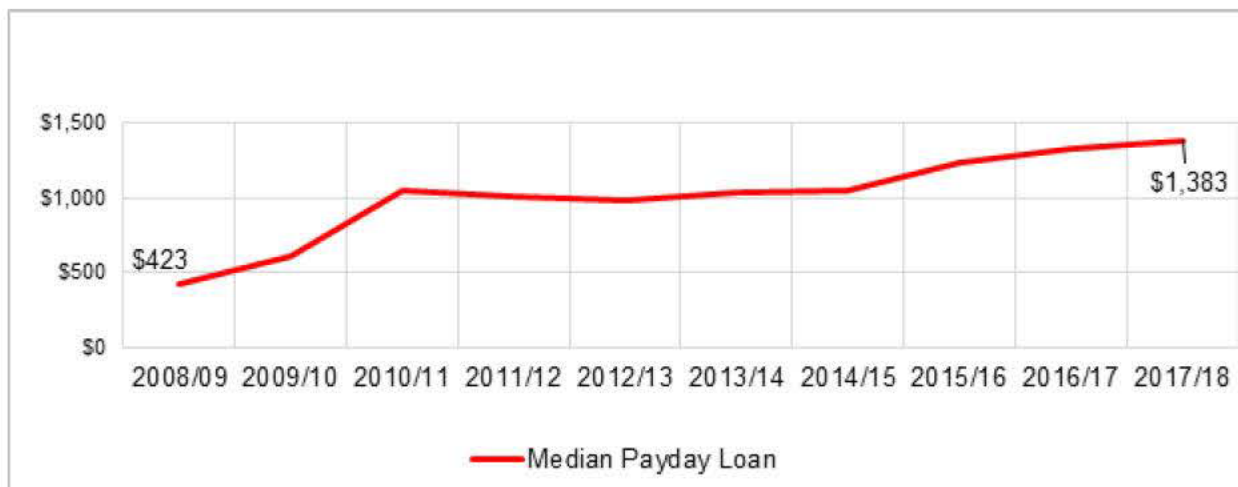
Median Payday Loan

A recurring theme from our front line staff is that payday loans and consumer leases are far too easy to access (as a result of rapid digital access growth) with few barriers to qualify. Evidence from our Moneycare services has found that the incidence of people with payday loan and consumer lease debts has increased significantly over the last decade, particularly for people aged 18-24 years. The proportion of people with predatory debt grew from 6 per cent in 2008/09 to 13 per cent in 2017/18 and tripled in real terms to a median value of $1,383.