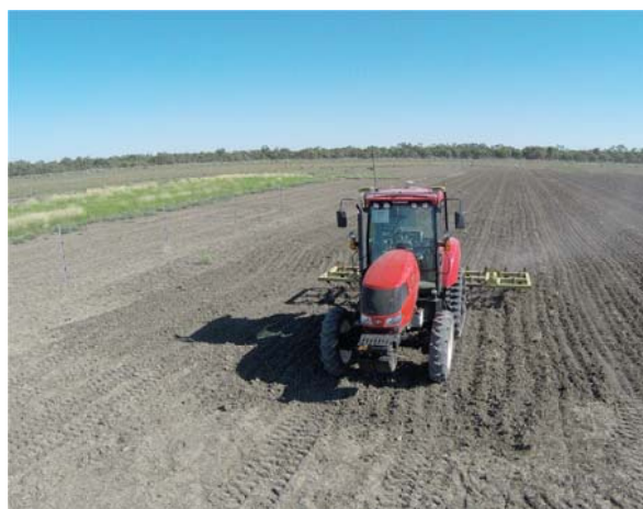
Robotic tractor guided by QZSS satellite positioning