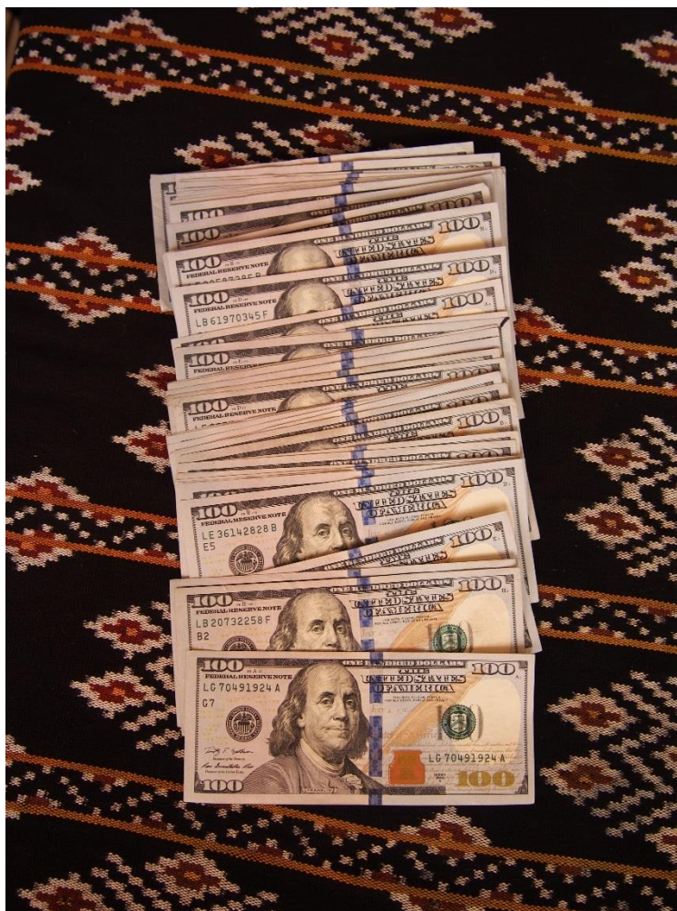
32,000USD which crew members told Amnesty International was paid to them by the Australian officials around 24 May 2015

The Indonesian police who detained the crew have confirmed publicly and to Amnesty International that the men had approximately 32,000 USD in their possession when they were apprehended. The police confiscated the money, and as of 19 August 2015, it was still in their possession. While on Rote Island in August 2015 Amnesty International researchers saw the money that was found on the crew, which consisted of dozens of new-looking 100 USD bills (see photograph), as well as a document listing the serial numbers of all the bills.