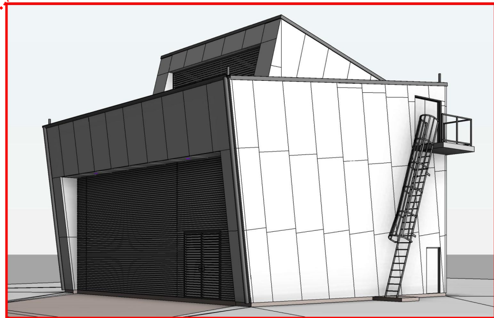
PERSPECTIVE OF SU7 LOOKING WEST