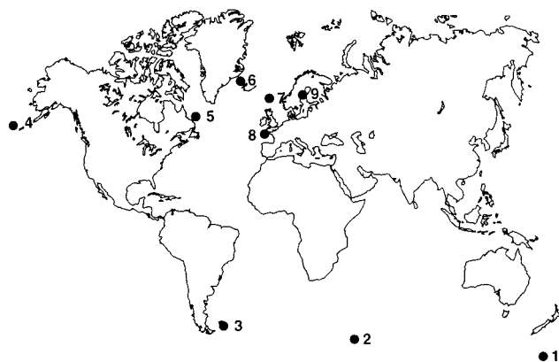
FIG. 1. Locations of seabird colonies where I. uriae ticks were collected. 1, Campbell Island, New Zealand; 2, Crozet Islands; 3, West Point, Falkland Islands; 4, Egg and St. Lazaria Islands, Alaska; 5, Gannet Island, Canada; 6, Flatey Island, Iceland; 7, Nólsoy, Faeroe Islands; 8, Cape Sizun, France; 9, Bonden Island, Sweden.

holds 950 pairs of kittiwakes ( Rissa tridactyla ), 300 pairs of herring gulls ( Larus argentatus ), and 30 pairs of guillemots ( U. aalge ). Red foxes ( Vulpes vulpes ) and weasels ( Mustela nivalis ) can be found in association with the bird colonies (8a). (ix) Bonden, situated in the northern part of the Baltic Sea, Sweden, holds 4,000 pairs of razorbills, 800 pairs of guillemots, and 500 pairs of black guillemots. No terrestrial mammals are present (25).