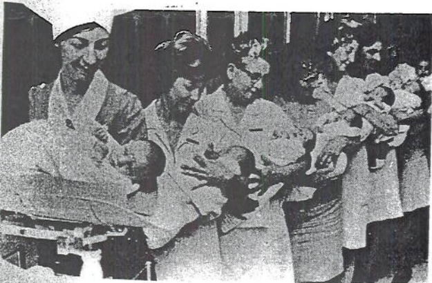
The volunteer 'pink ladies' who generously gave of their time to 'mothering' the adoption babies

The workload of the nursing staff, in addition, was greatly assisted with the help of volunteer 'Pink Ladies' who responded to media appeals, undertaking the changing, feeding, and loving of the little ones.