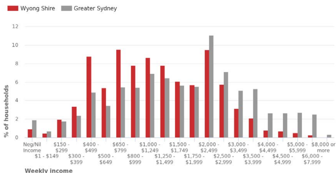
Weekly household income, 2016