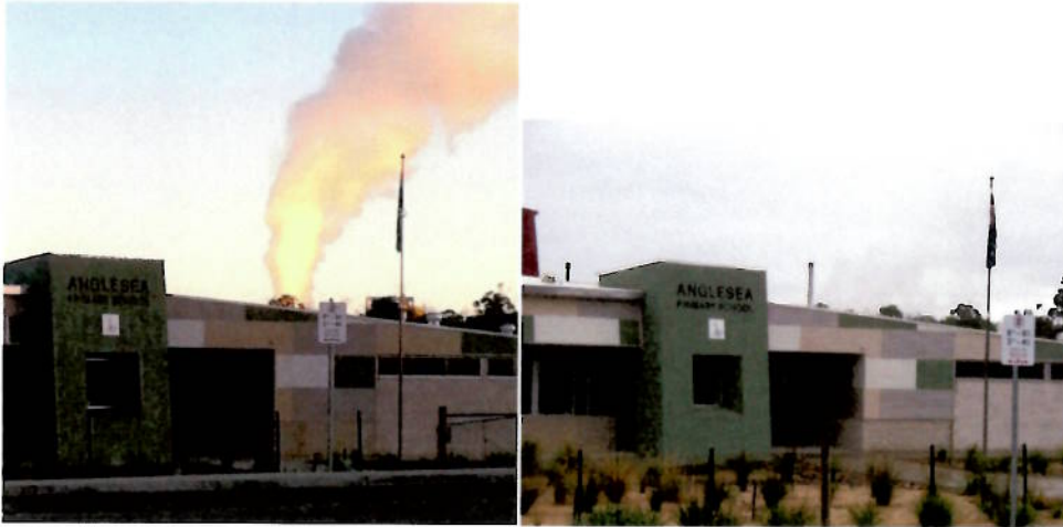
Photos 1 (left) showing cooling tower steam plume and 2 (right) actual power station stack

The caption to photo 1 (shown below left) on page 2 of submission 52 incorrectly states that the photo shows a smoke plume from the power station. In fact the photo actually shows steam from the power station's cooling tower. The actual power station stack, which was obscured by the steam plume, can be seen in the right hand photo below. Steam from the cooling tower can be seen to the right of the stack. If "smoke" was coming from the stack in photo 1 the stack itself would have been visible.