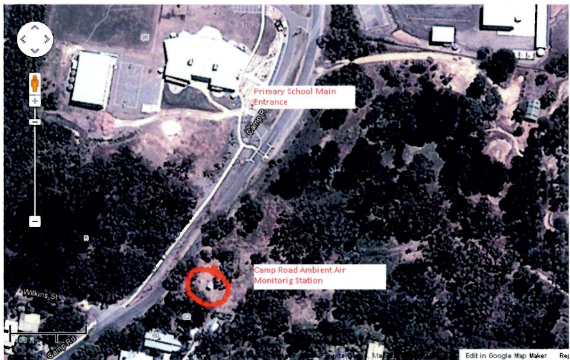
Photo 3 Showing location of Camp Road Ambient Air Monitoring Station to the primary school

In the last paragraph on page 8 of the submission there is a comment about the 2008 HHRA saying that “It makes no effort to look at the combined impact of pollutants”. In fact the HHRA followed the methodology of the Victorian EPA, which is to include in the assessment any emission that has a maximum ground level concentration exceeding the SEPP design criteria. This is a conservative (health protective) methodology as the design criteria concentration is lower than the SEPP air quality objective. If an emission’s maximum ground level concentration does not exceed the design criteria it is not thought to be a meaningful contributor to health risk.