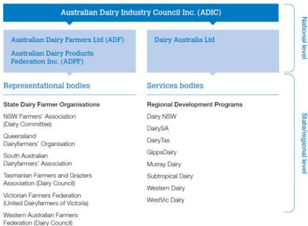
Figure 3: Australian dairy industry organisational structure