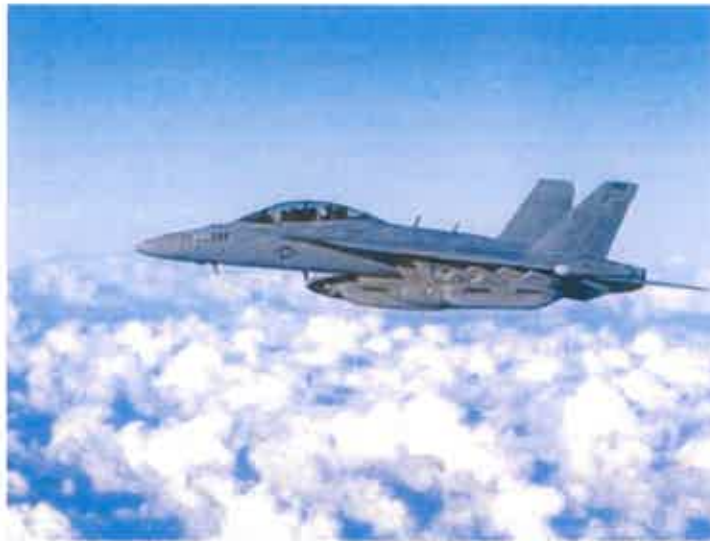
The Department of Defence is holding a public information session to outline the proposed modification of the facility to be capable of testing a range of aircraft engines which could make a bit of a racket at Amberley.