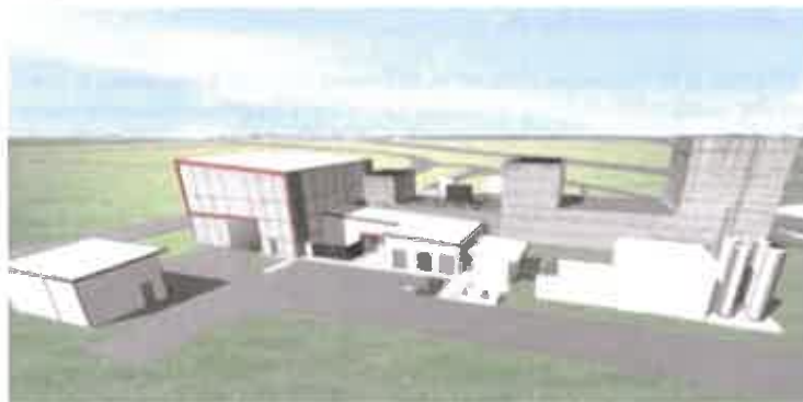
Figure C-1 – Page 1 of Fact Sheet