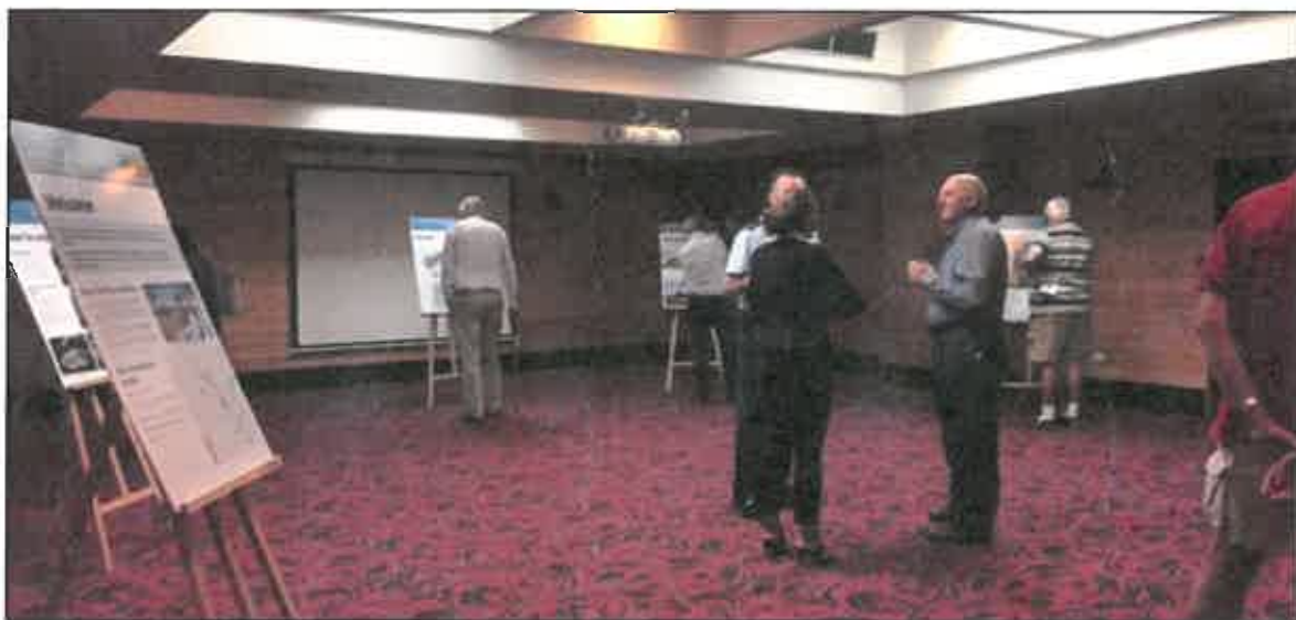
Figure E-1 -Public Information Session at the Ipswich Civic Centre

The room was configured with a series of display boards that talked to key project areas. The display boards explained the project, provided information around environmental considerations and the next steps in the approval process.