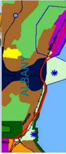
Albany LP Strategy – 2010 – Strategic Plan Urban Map 9B

In 15 years, no-one has put forward the alternative road / rail transport solution - Albany Ring Road Stage 5 (Hanrahan Road to Port), incorporating road & rail upgrades, grade separation and a slurry pipeline for the Grange Project along the waterfront - effectively, the Port of Albany will have to oppose waterfront development forever.