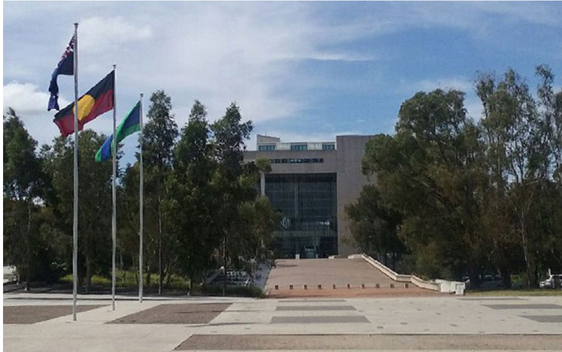
Figure 8.3: Matthieu Gallois. Aboriginal Flag in front of the High Court of Australia, Canberra. 2017.

consideration to the ramifications of the flag's proclamation. By chance, the flag's vague status as a national flag has worked well for the government, and it has not needed to detail or clarify its policy relating to the flag's use as a national symbol.