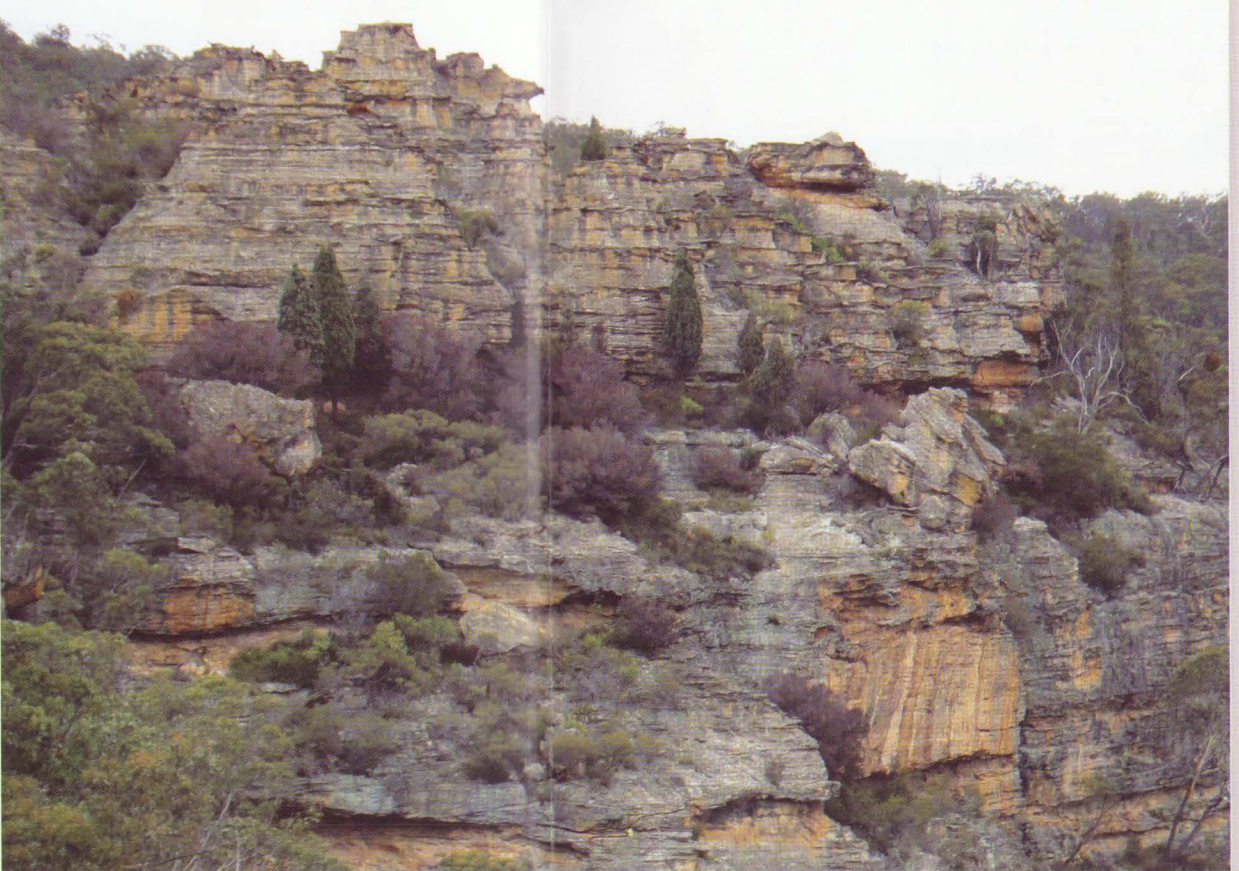
Gardens of Stone, on the western side of Newnes State Forest

To support the Proposal and for more information go to: