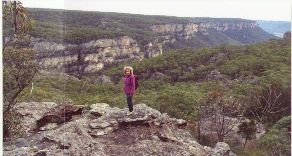
Looking down the end section of Carne Creek from Fire Trail No.5