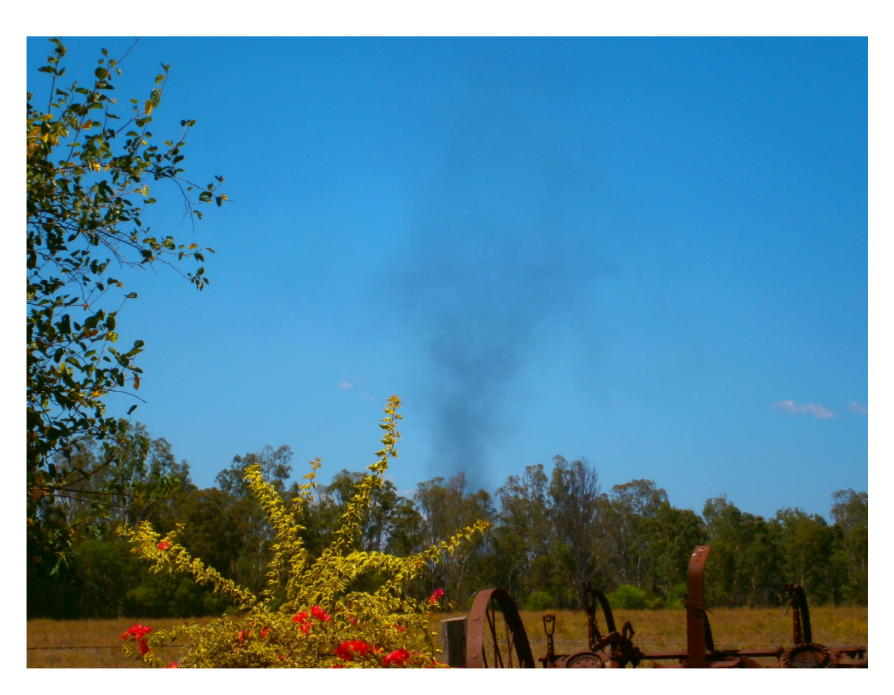
(above) coal dust from the loadout plant at Boundary Hill, as seen from house yard