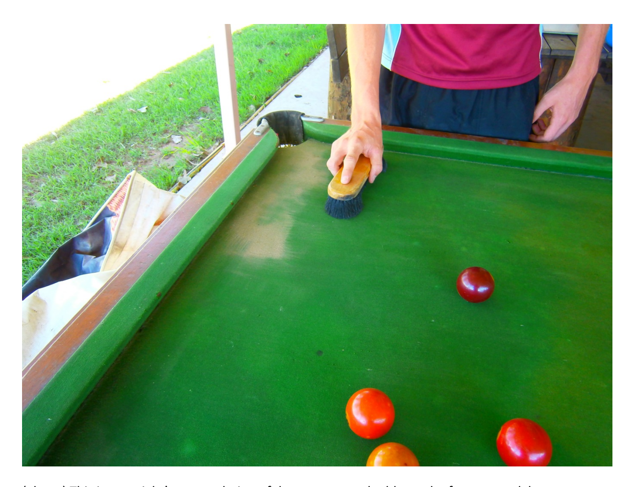
(above) This is one night's accumulation of dust on our pool table on the front verandah.