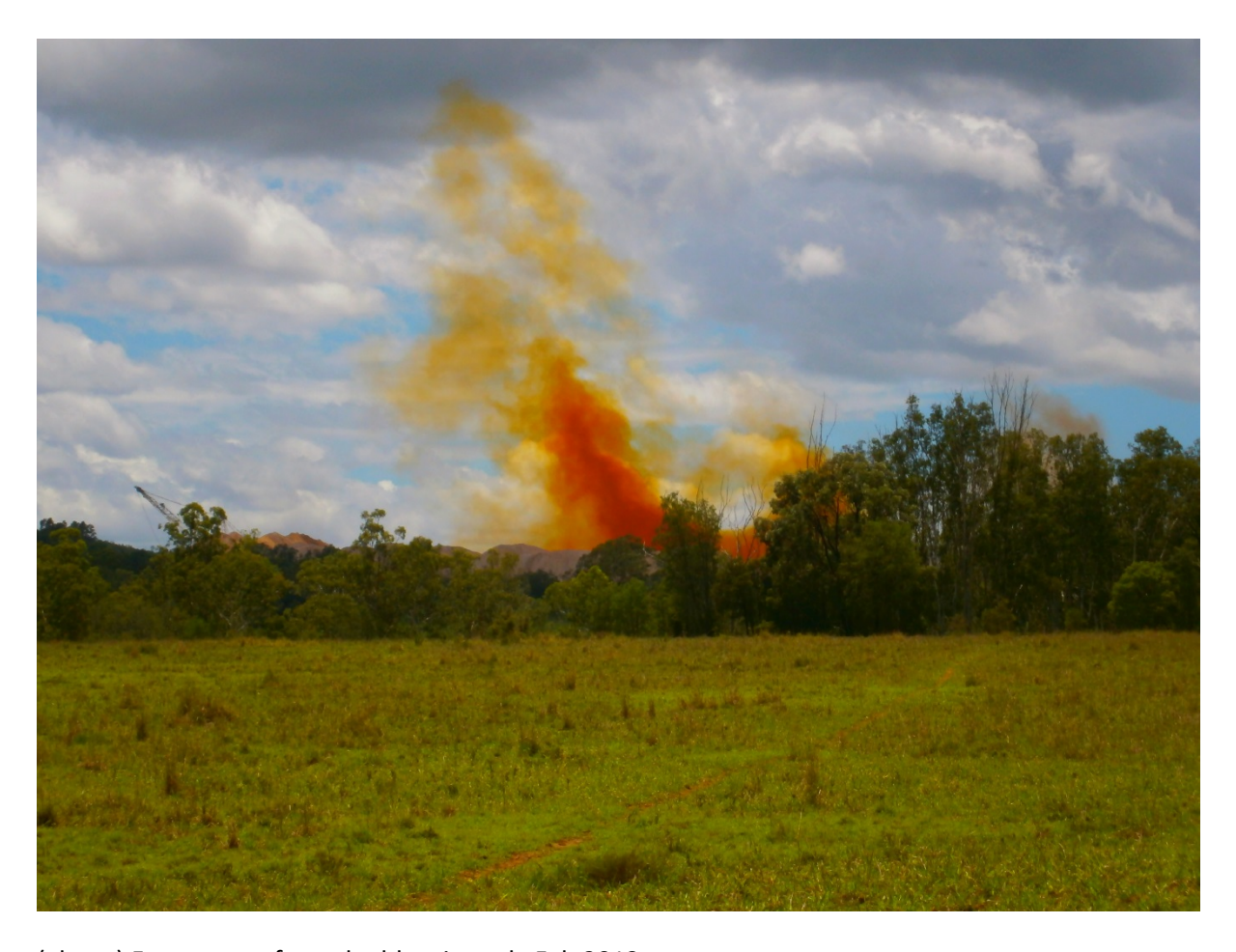
(above) Fume event from the blast in early Feb 2013.