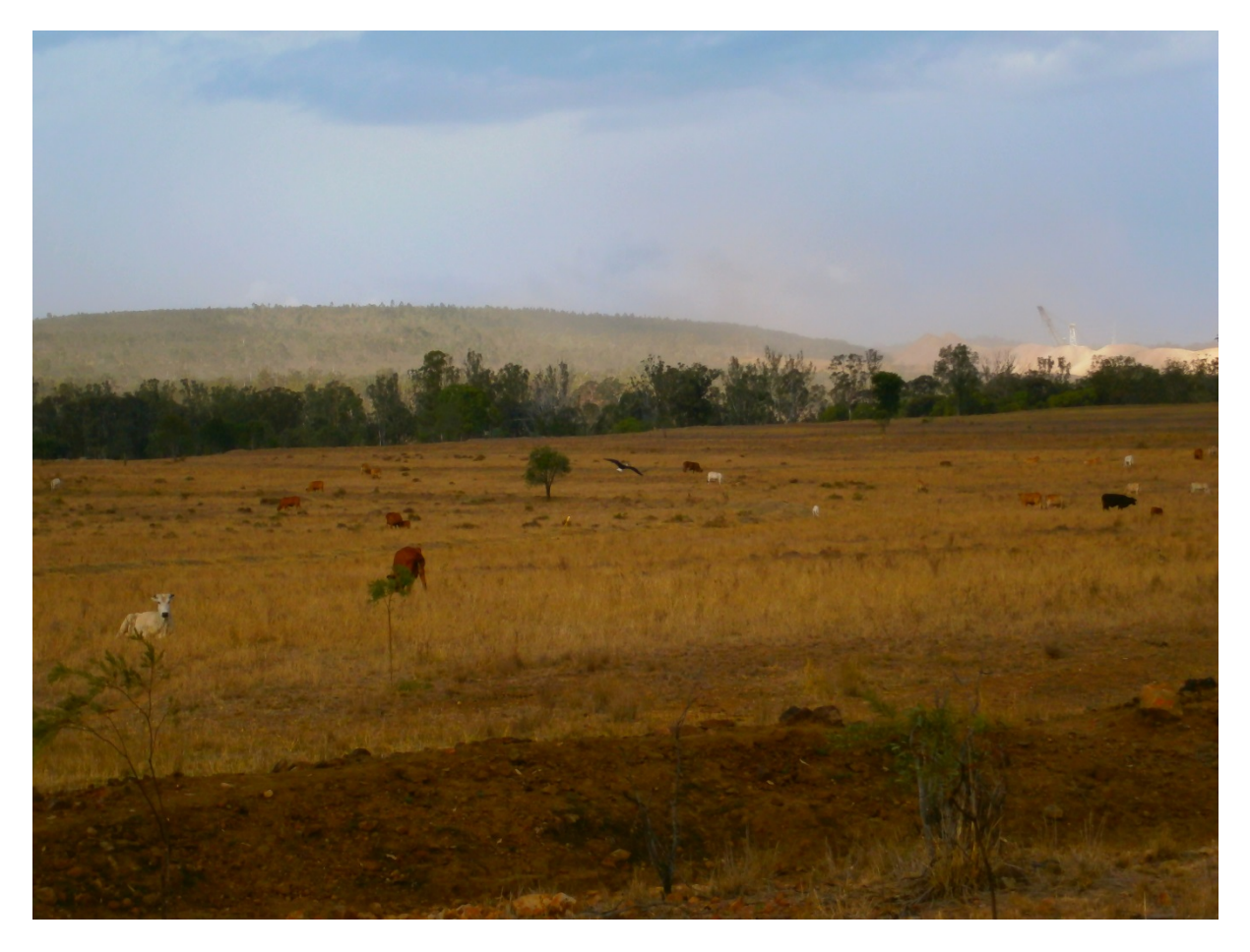
(above) dust haze from Boundary Hill is clearly visible from our paddock