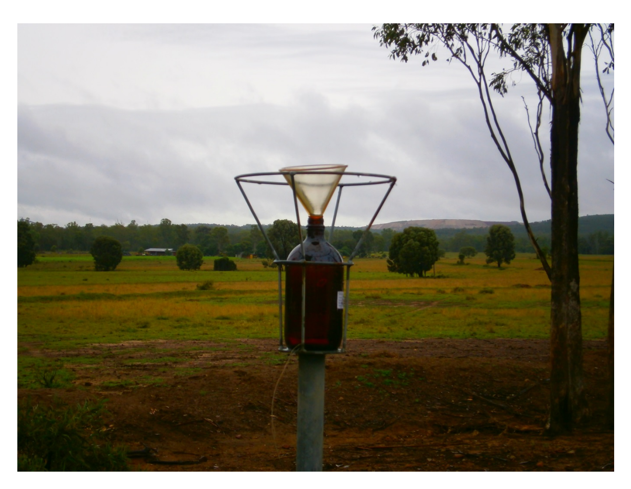
(above) Our house is visible to the left of the "dust monitor", and the mine is visible in the background to the right.