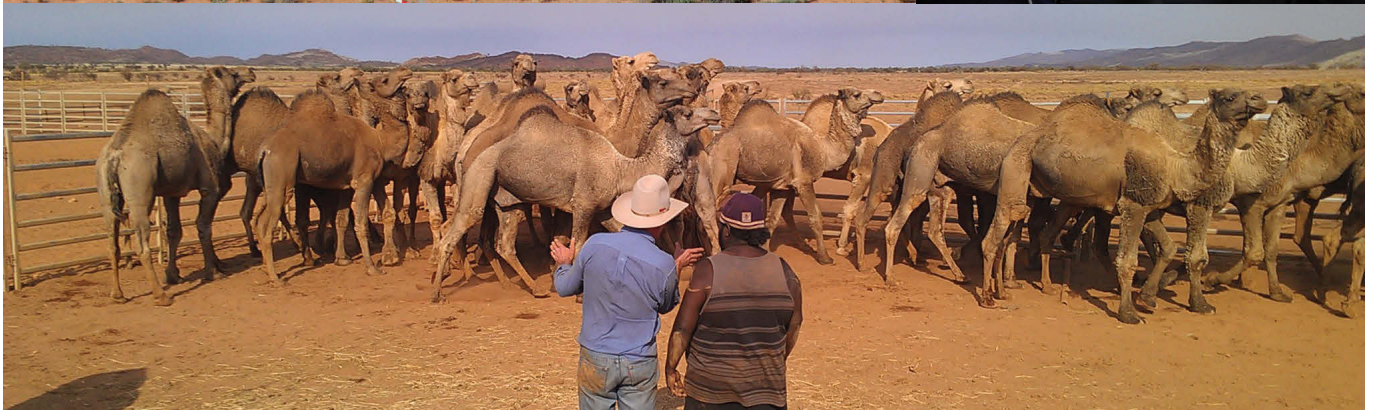
The main feral camel management methods are aerial culling, ground culling and mustering.

Another consideration is the ability of the technique to achieve a rapid and sustained reduction in the pest animal population. This consideration has animal welfare implications, by avoiding the need for recurrent culling of large numbers of animals, and is an issue that is identified in RSPCA Policy E02 Management of wild animals .