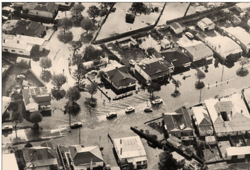
Image shows Bunbury flooding resulting from Tropical Cyclone Albany in 1978. Alby tracked down to the SW corner of WA almost 2,000km south of where cyclones typically make landfall. This area is the same as that shown 'at risk' on the previous page map.

The Bureau also noted in its 2016 Annual Climate Statement that weather is becoming more extreme. The impact is natural disasters – fires, cyclones, flooding and drought.