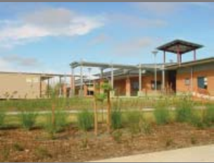
Xavier College, Llandillo