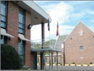
St Mary's Primary, Rydalmere

For more information visit www.pmdl.com.au