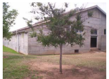
Existing corrugated iron school hall

www.parra.catholic.edu.au/projectgenesis