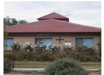
Entrance of St Laurence's Primary