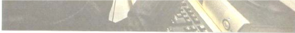
HANDS ON: Deputy Prime Minister Julia Gillard goes back to school on Thursday after the early-morning launch of the My School website.