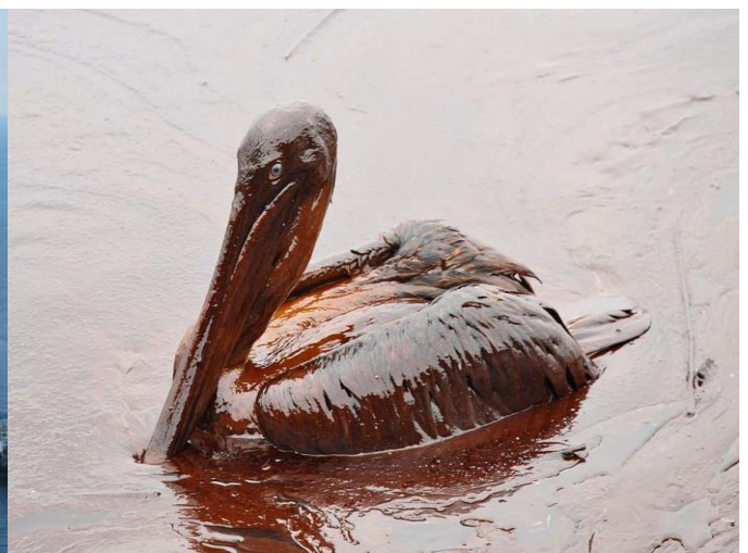
A BP Oiled Brown Pelican near Grand Isle, Louisiana.