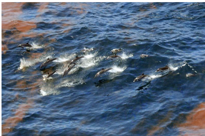
Striped dolphins ( Stenella coeruleoalba ) observed in emulsified oil on April 29, 2010.