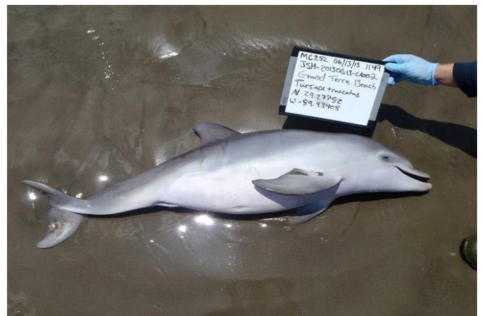
One of the stranded dead dolphins after the BP oil spill.