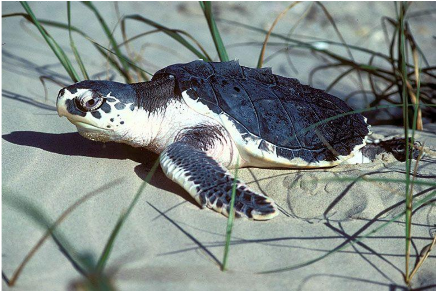
Kemp's ridley sea turtle.

Decades of efforts to restore the Gulf of Mexico's populations of critically endangered Kemp's ridley sea turtles have stalled, and the species may be on the decline again, worrying new research reveals.