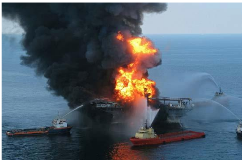
Platform supply vessels battle the blazing remnants of the BP off shore oil rig Deepwater Horizon.

The oil rig explosion killed 11 people and injured 17 others. Over 8,000 marine animals (birds, turtles, mammals) were reported dead, just six months after the spill, many that were on the endangered species list. Marine animals are still washing up dead today as a result of illnesses caused by BP's spill in the Gulf of Mexico.