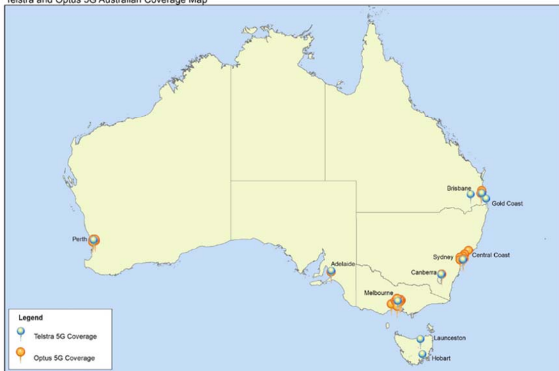
Telstra and Optus 5G Australian Coverage Map