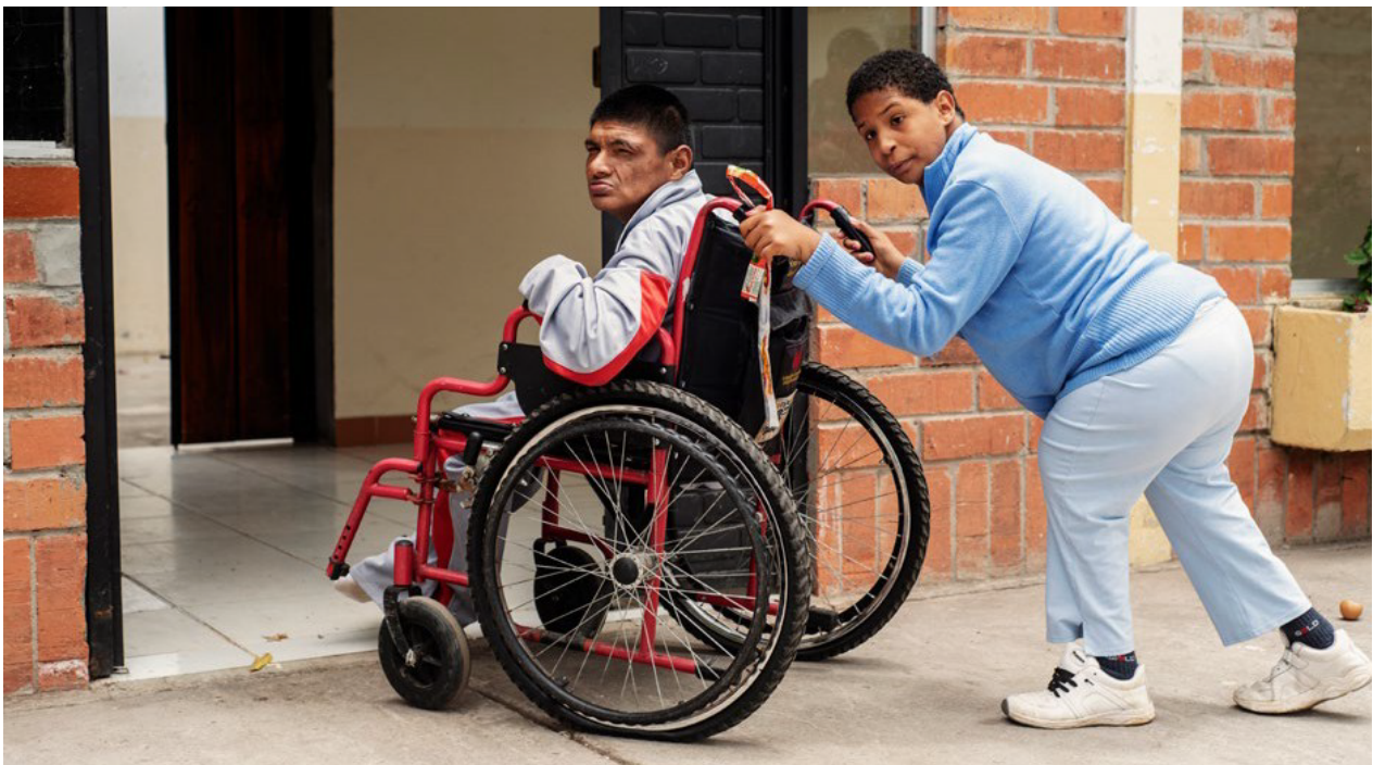
from the project Fifteen Percent.