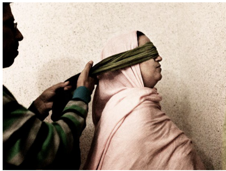
from the project Saharawi.