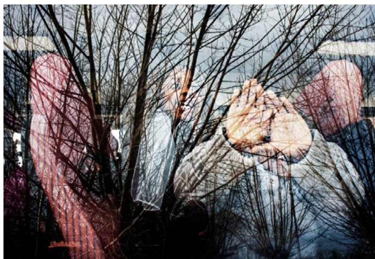
from the project Saharawi.