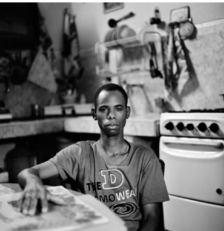
from the project Fifteen Percent.