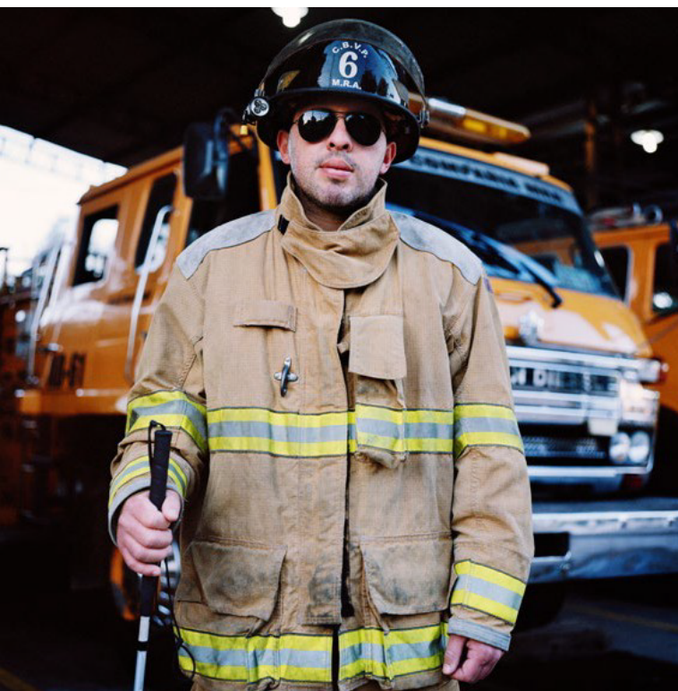
Photo by Christian Tasso. It was taken as part of the European Union project Bridging the Gap II – Inclusive Policies and Services for Equal Rights of Persons with Disabilities and appears courtesy of the International and Ibero-American Foundation for Administration and Public Policies.