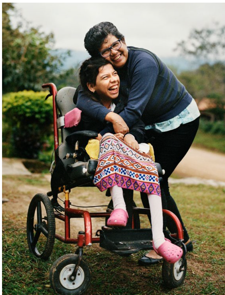
Photo by Christian Tasso. It was taken as part of the European Union project Bridging the Gap II – Inclusive Policies and Services for Equal Rights of Persons with Disabilities and appears courtesy of the International and Ibero-American Foundation for Administration and Public Policies.