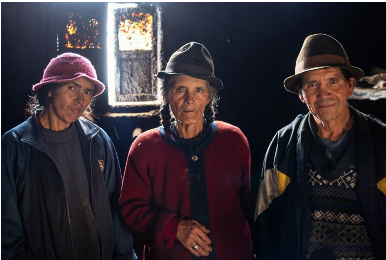
from the project Fifteen Percent.