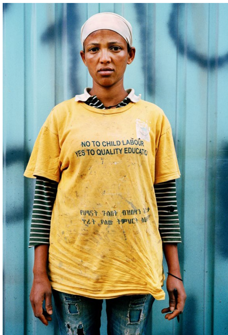
Photo by Christian Tasso. It was taken as part of the European Union project Bridging the Gap II – Inclusive Policies and Services for Equal Rights of Persons with Disabilities and appears courtesy of the International and Ibero-American Foundation for Administration and Public Policies.