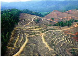
Vast expanses of Sumatran rainforest are being turned into paper pulp.

Second, China, in its relentless pursuit of timber, almost exclusively seeks raw logs. Raw logs are the least economically beneficial way for developing nations to exploit their timber resources, as they provide only limited royalties and little employment, workforce training, and industrial development. As a result, most of the profits from logging are realized by foreign timber-cutters, shippers, and wood-products manufacturers. A cubic meter of the valuable timber merbau ( Intsia bijuga ), for instance, yields only around $11 to local communities in Indonesian Papua but around $240 when delivered as raw logs to wood-products manufacturers in China, who profit further by converting it into prized wood flooring.