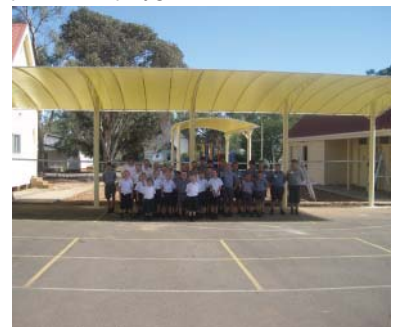
St Patrick's students enjoying their new shaded learning area

www.parra.catholic.edu.au/projectgenesis