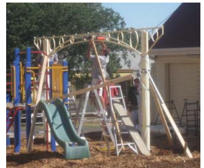
Constructing the COLA so it covers part of the playground

The shaded area also extends over a section of the playground containing static play equipment which means the students can utilise this area in summer as well.